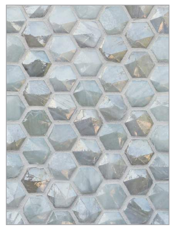
Sway (1" hex)