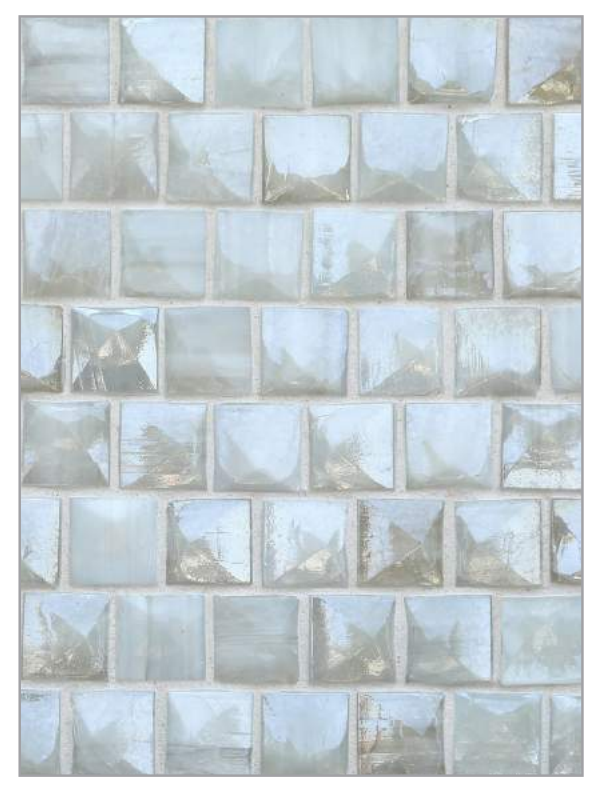
Nami (1 x 1)