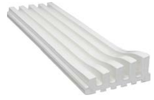
Rise Left (4 x 13)