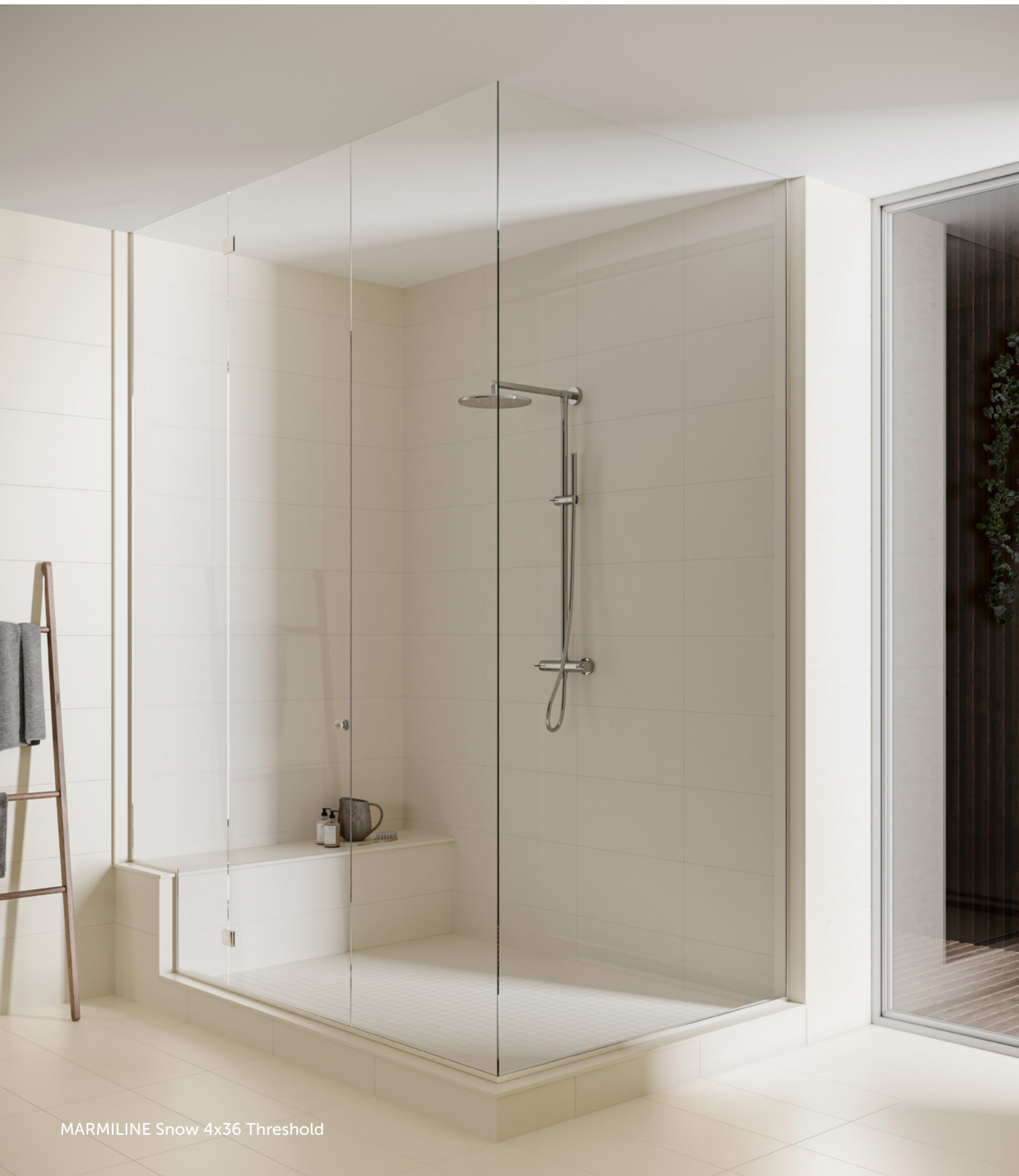
MARMILINE Snow 4x36 Threshold