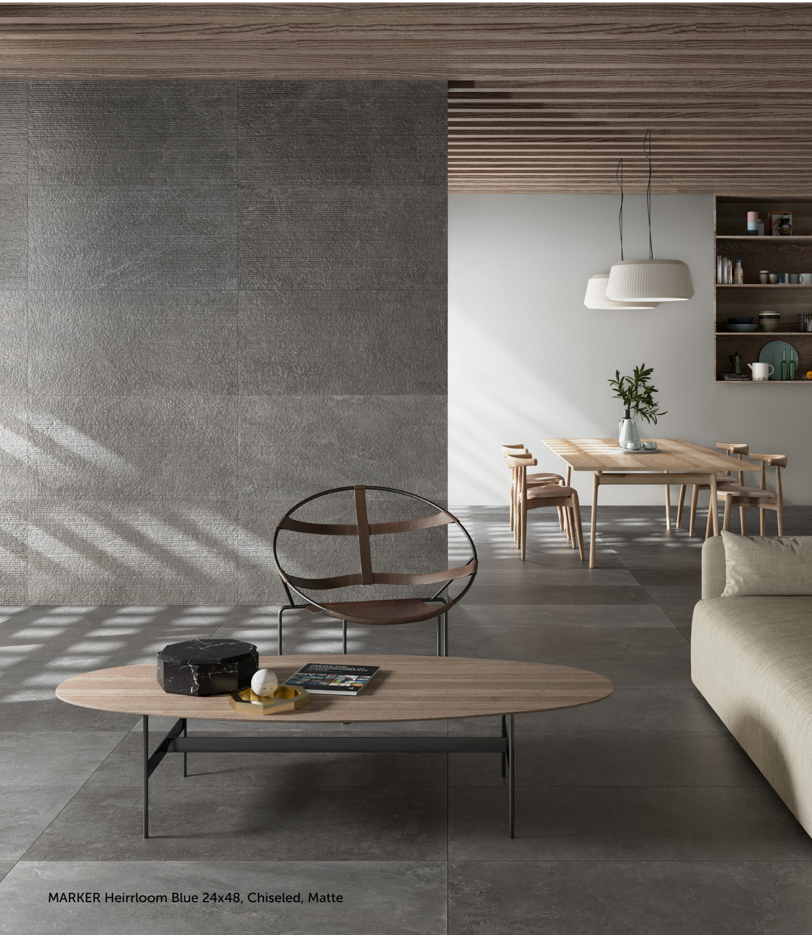
MARKER Heirloom Blue 24x48, Chiseled, Matte