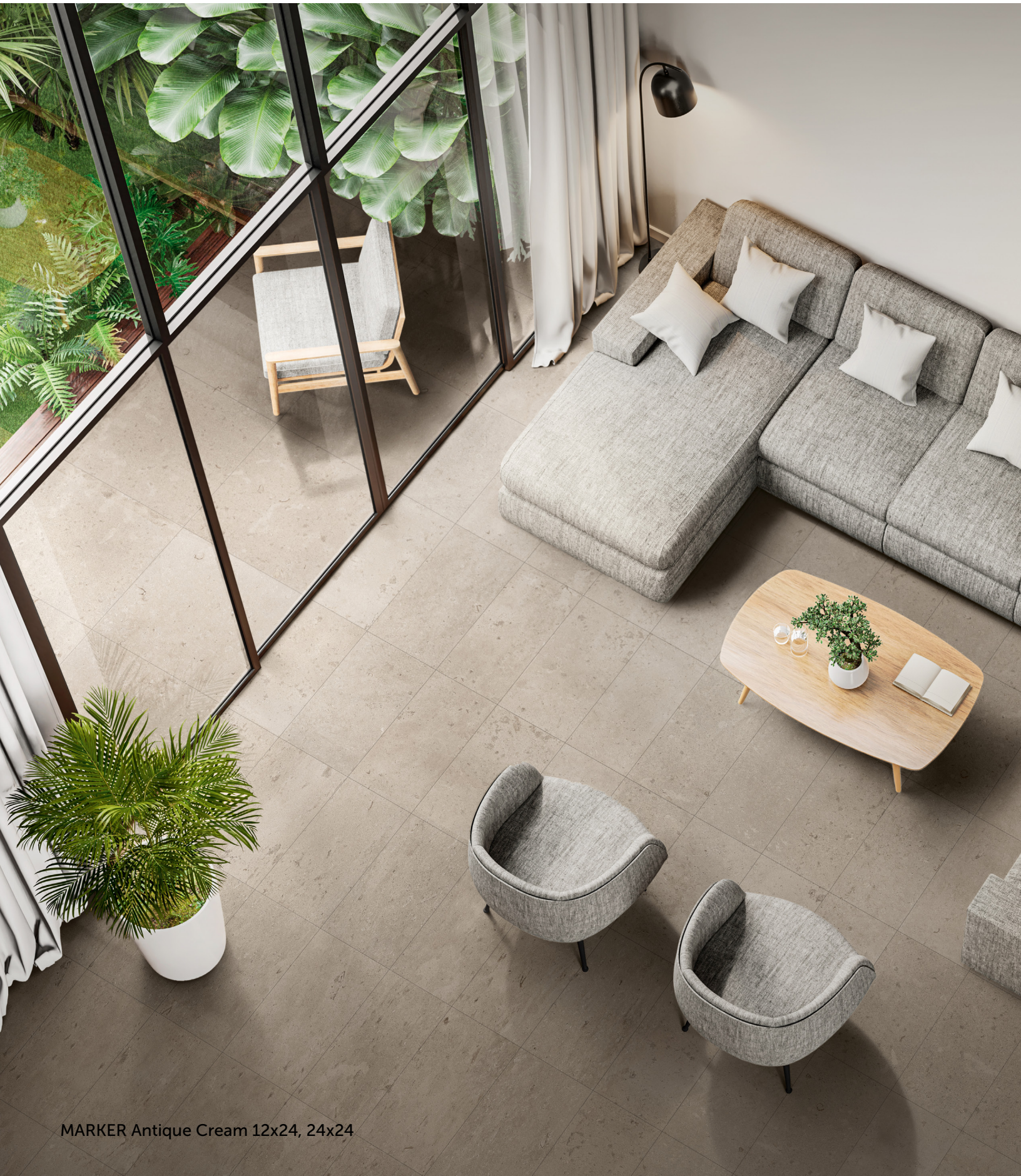
MARKER Antique Cream 12x24, 24x24