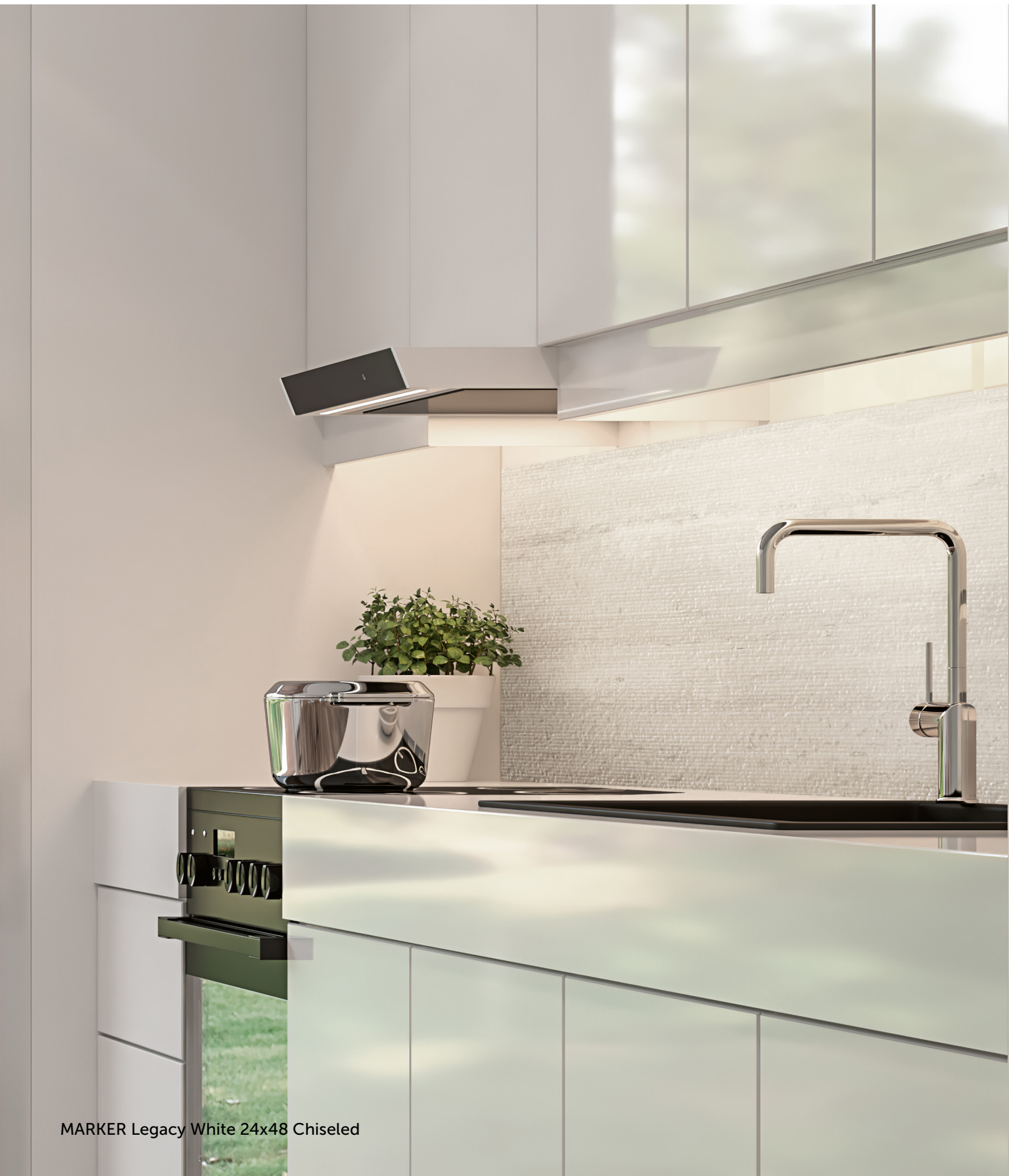
MARKER Legacy White 24x48 Chiseled