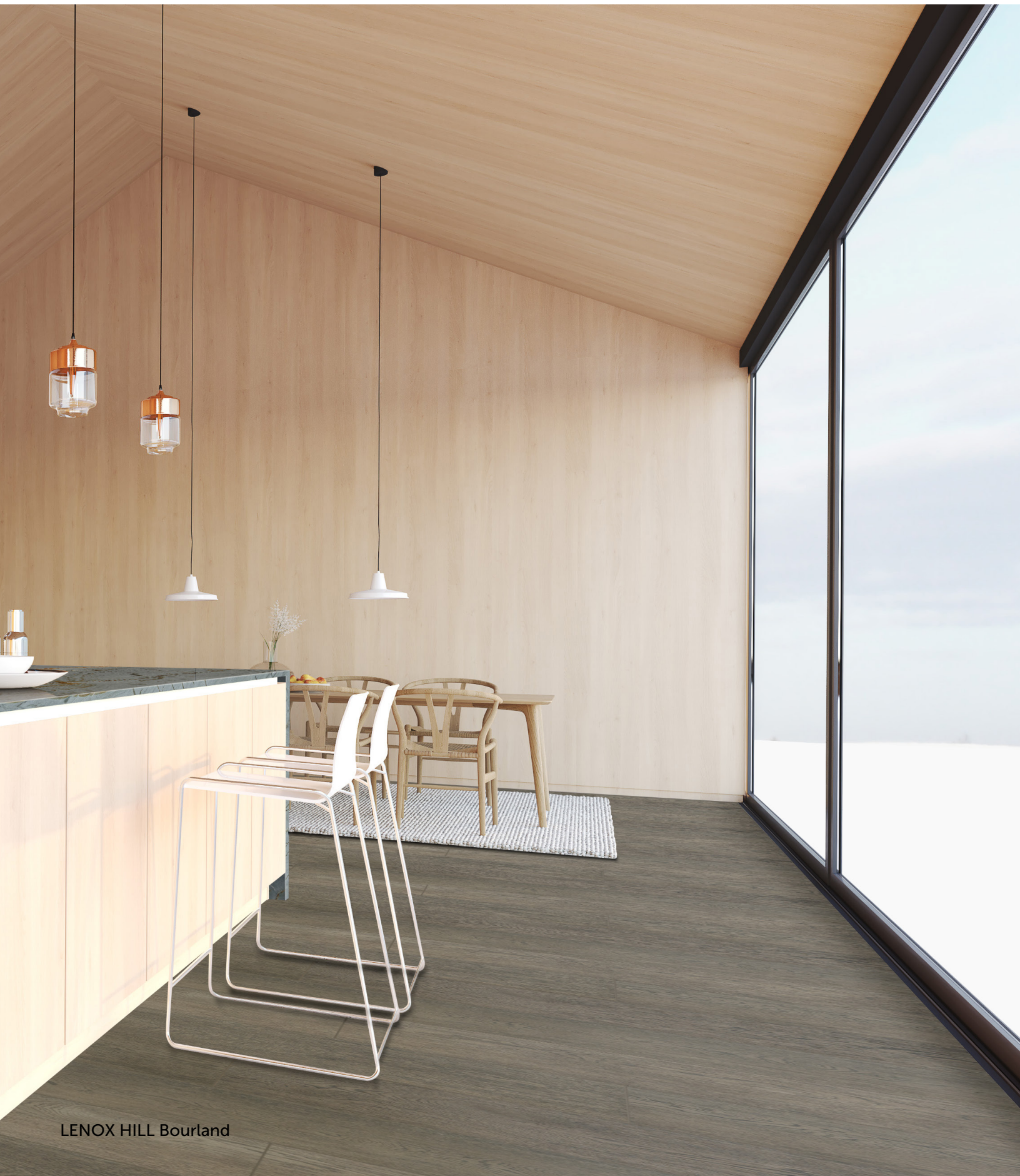
LENOX HILL Bourland