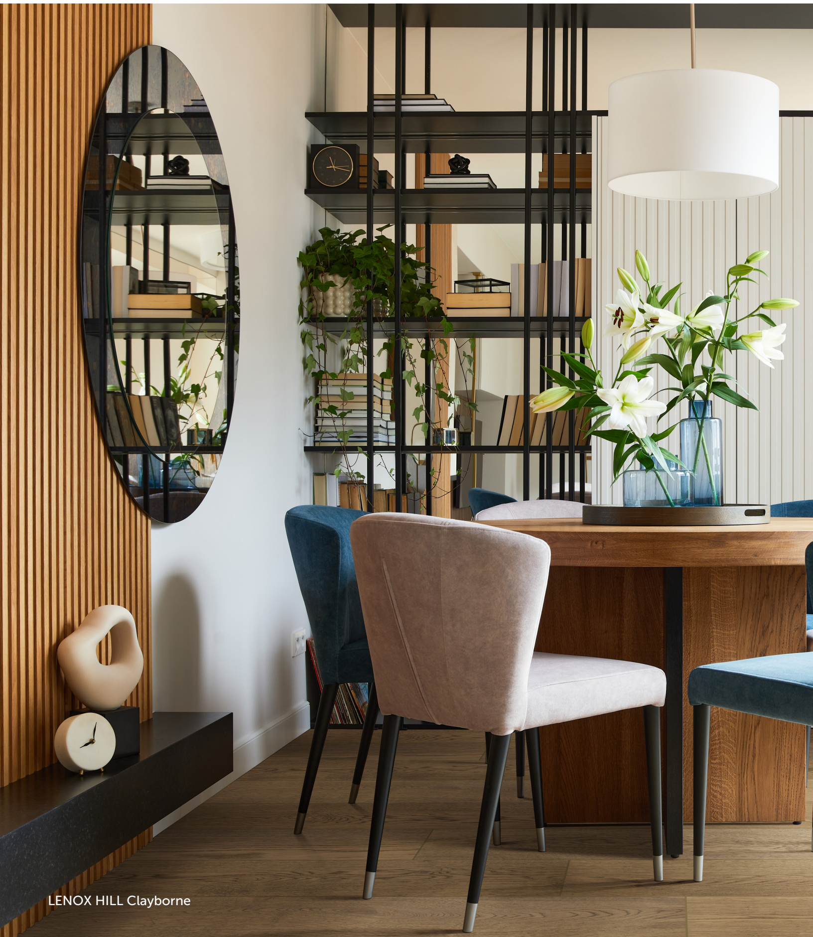
LENOX HILL Clayborne