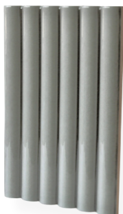
Nuvola Intenso Crackle