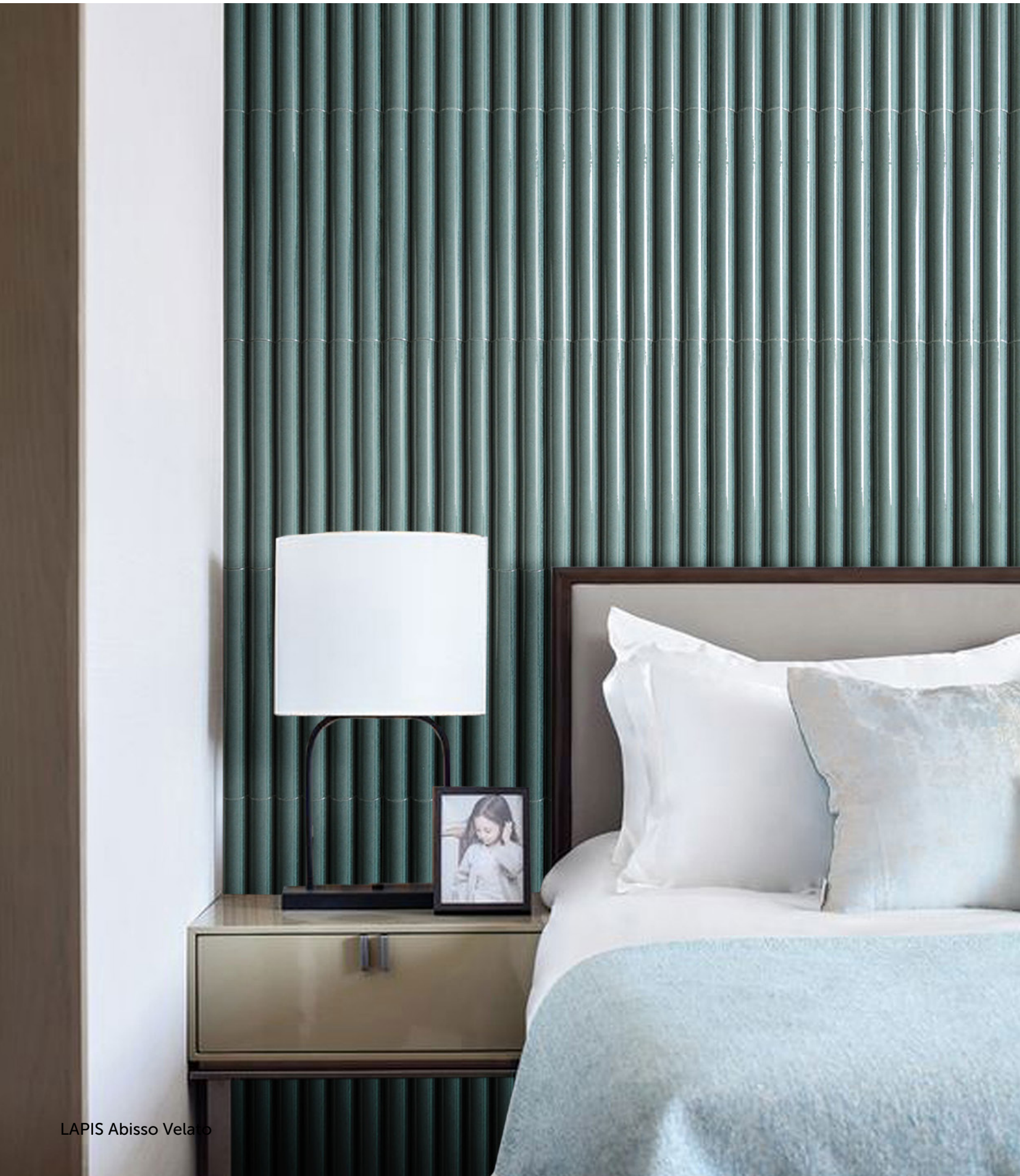
LAPIS Abisso Velo