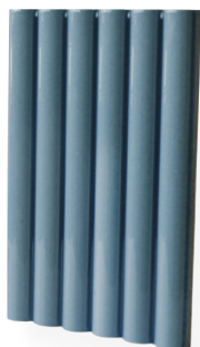
Oceano Velato Crackle