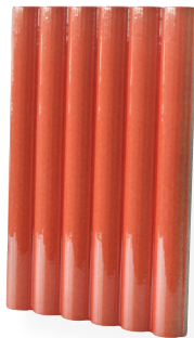
Rosso Corallo Crackle