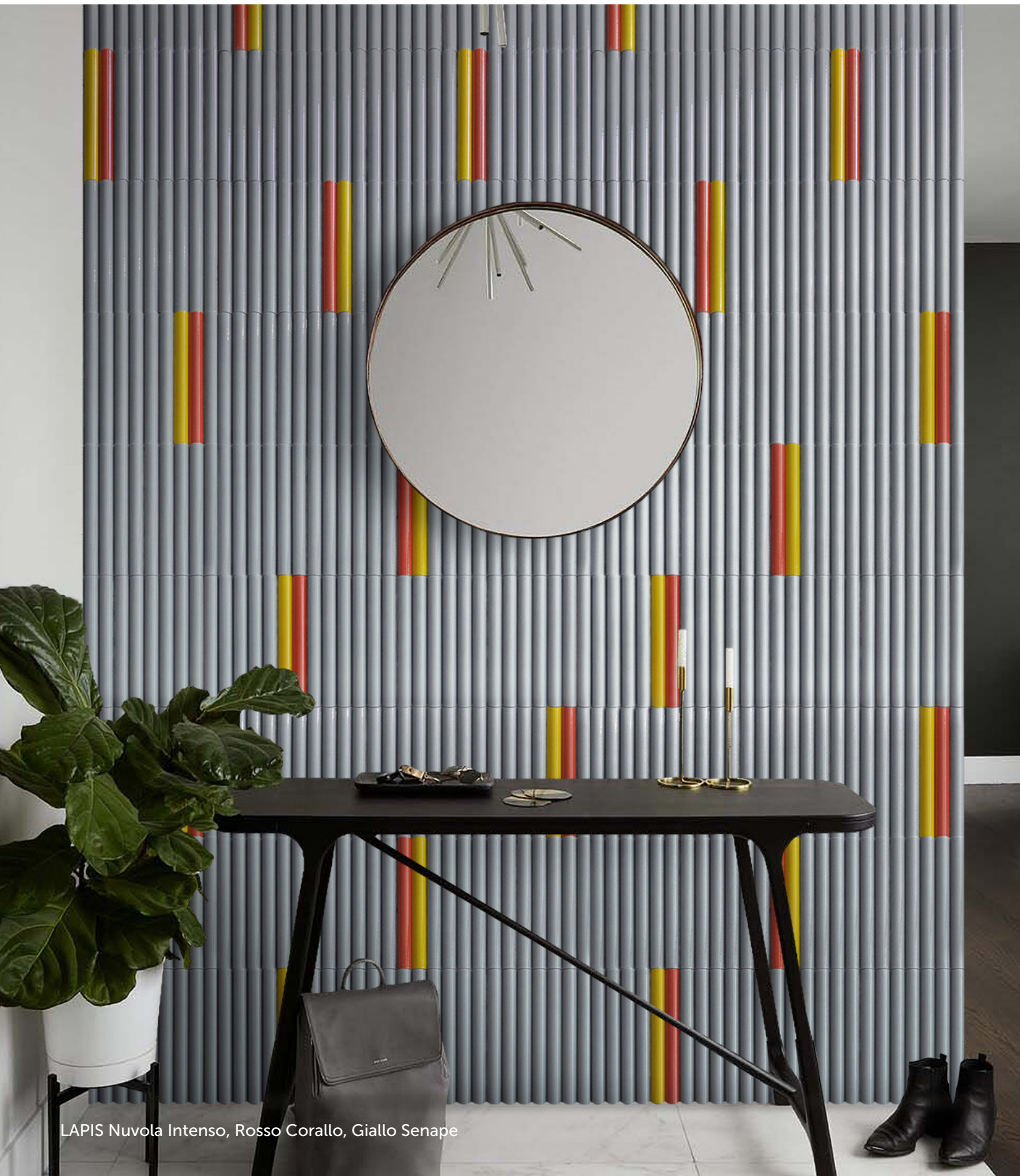
LAPIS Nuvola Intenso, Rosso Corallo, Giallo Senape