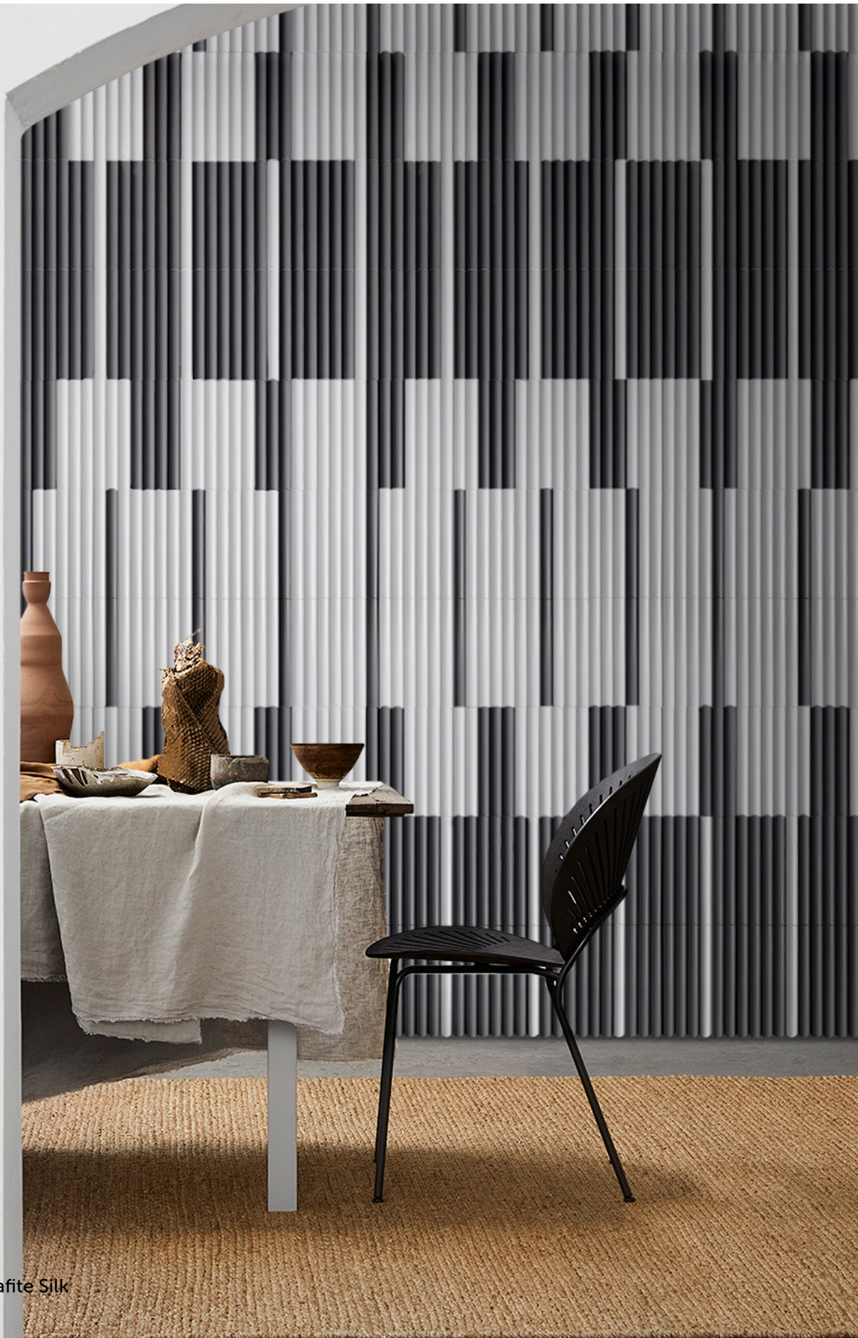
LAPIS White Moon Silk, Grafite Silk