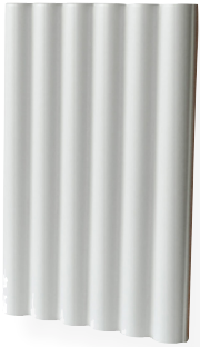
White Moon Satin