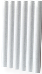
Bianco Maiolica Crackle