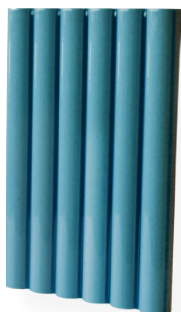
Lago Velato Crackle