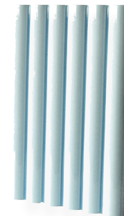
Lago Limpido Crackle