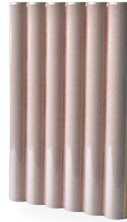
Rena Limpido Crackle