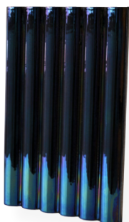
Nero Lustrado Glossy Metallic