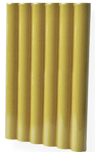
Giallo Senape Crackle