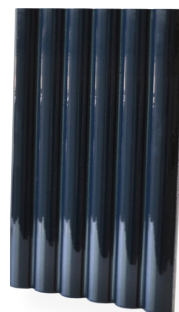
Bleu Nocte Crackle