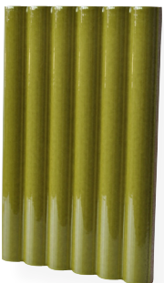
Verde Oliva Crackle