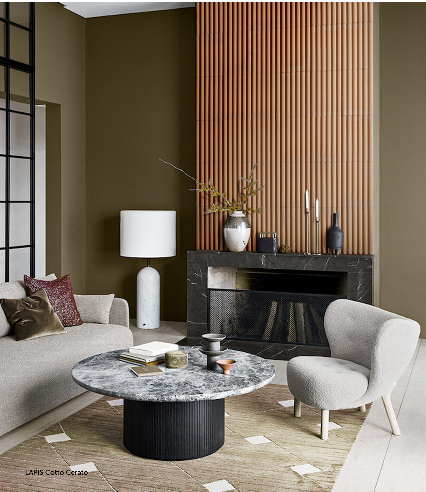
LAPIS Cotto Cerato