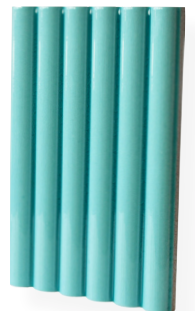
Lago Intenso Crackle