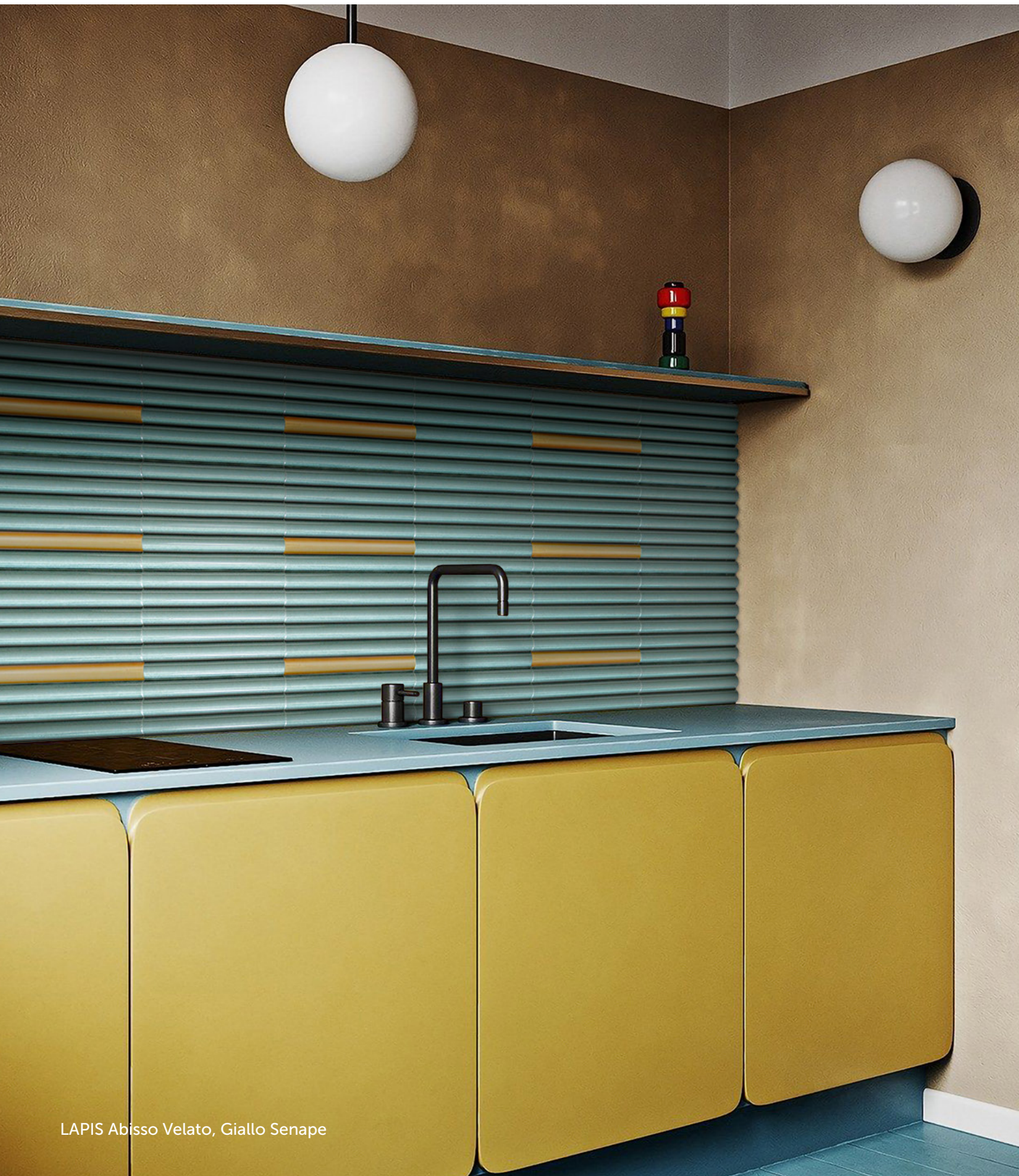
LAPIS Abisso Velato, Giallo Senape