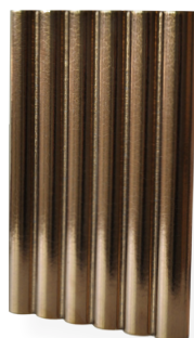
Bruno Dorato Metallic