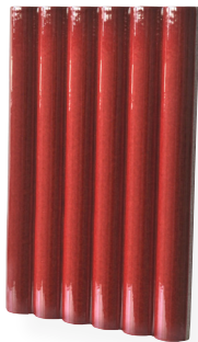
Rena Intenso Crackle