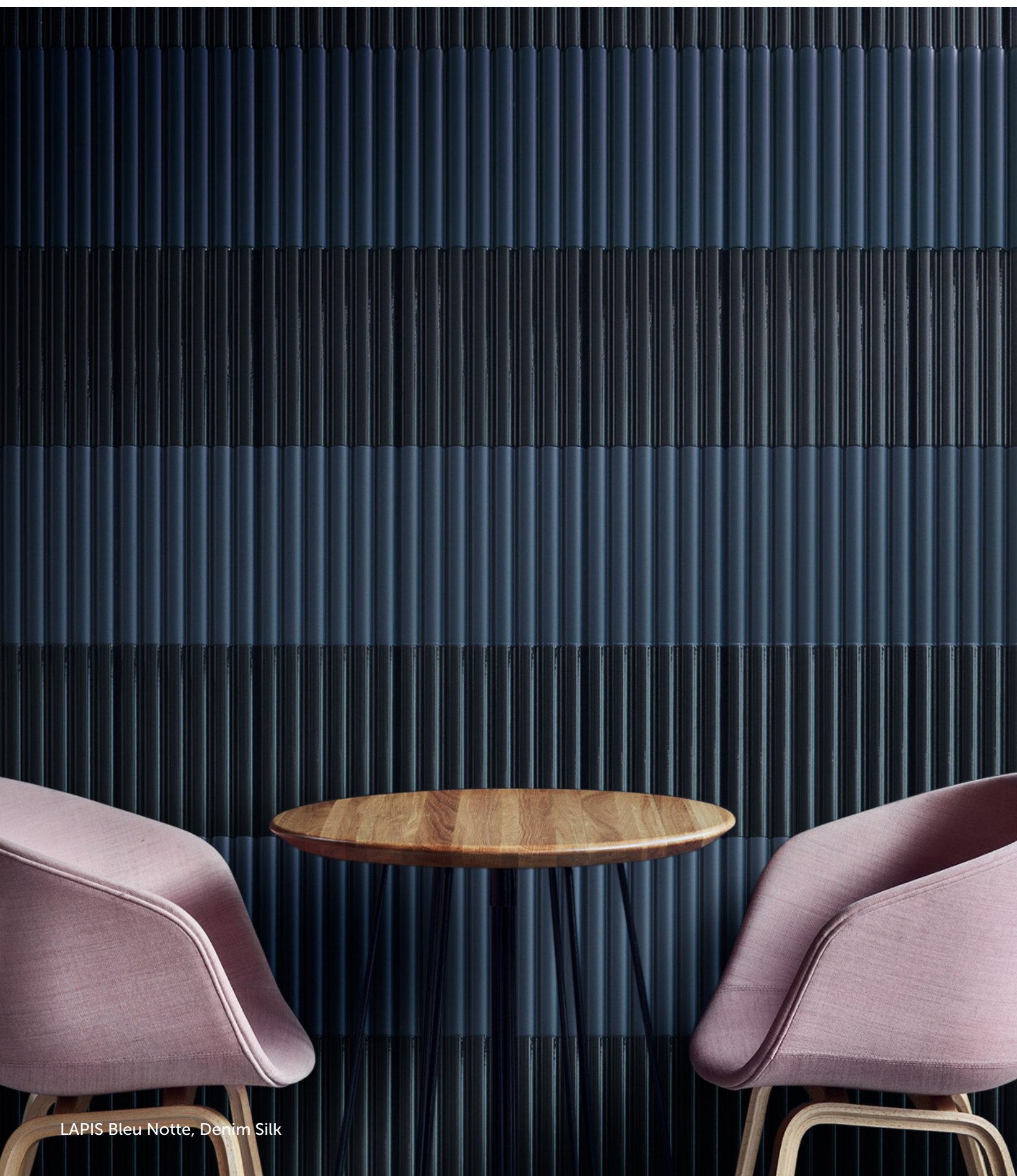
LAPIS Bleu Notte, Denim Silk