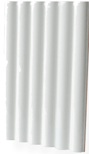
White Moon Crackle