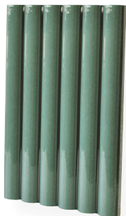
Rio Velato Crackle