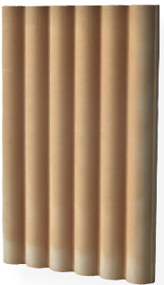
Cotto Cerato Unglazed