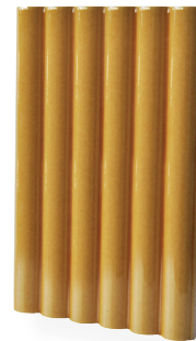
Oasi Intenso Crackle