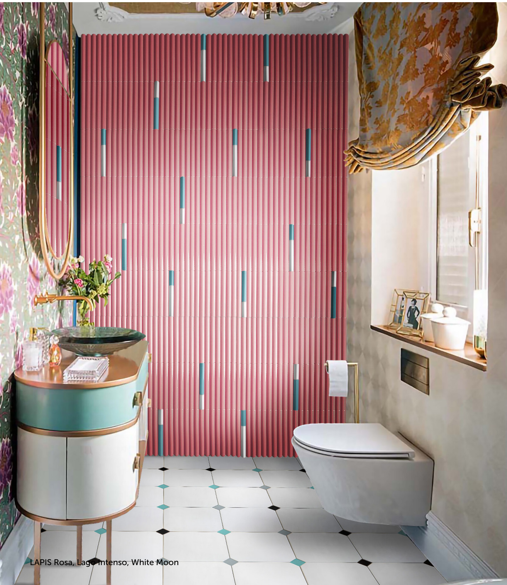
LAPIS Rosa, Lago Intenso, White Moon