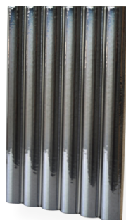
Argento Siderale Metallic