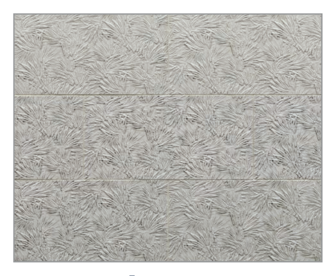
Lewa~(6~x~12) A breathtaking interpretation of tropical foliage.