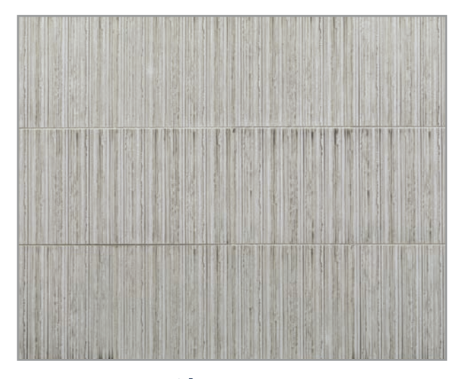
Tide\ Dye\ (6\ x\ 12) Named after the heritage Tommy Bahama fabric of the same name, this tile emulates the ever changing tides.