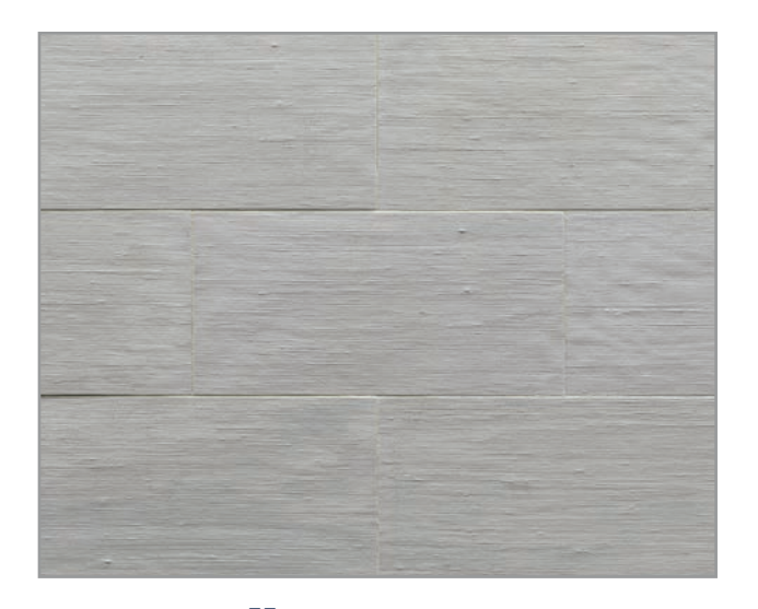
Homespun~(6\,x\,12) This softly textured, versatile tile is inspired by natural linen fabric.