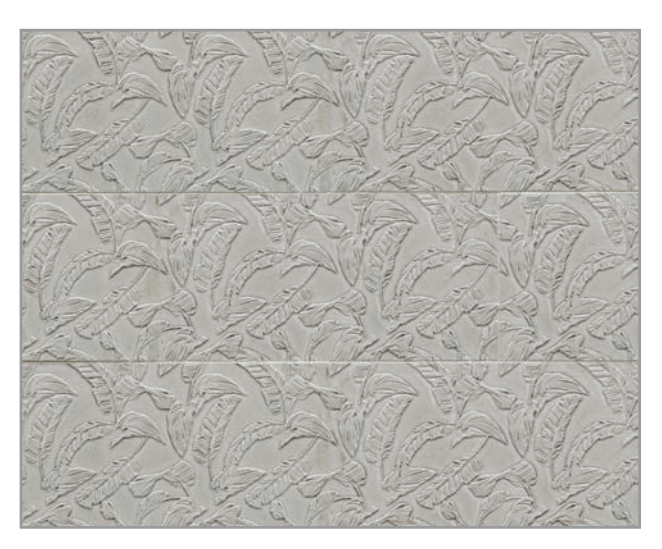
Palm\ Retreat\ (6\,x\,12) Evokes the feeling of lush palms swaying in the breeze.