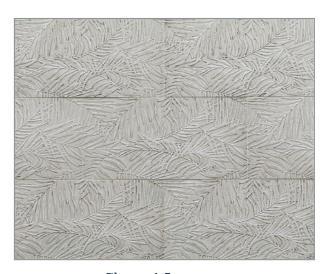
Shangri-La~(6\,x\,12) Wispy pattern of fern fronds conjure images of a tranquil paradise.