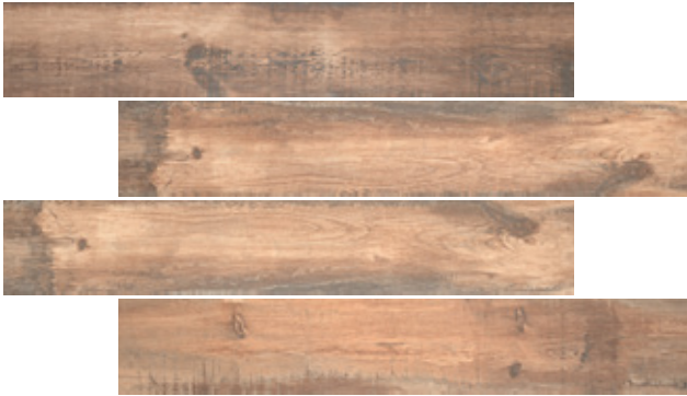
8x48 NAT RECT | #28600E