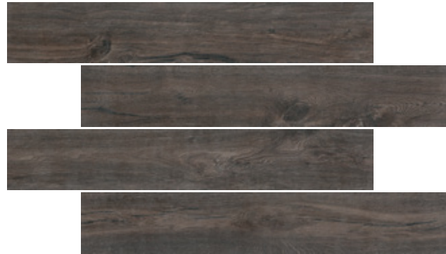
8x48 NAT RECT | #27079E