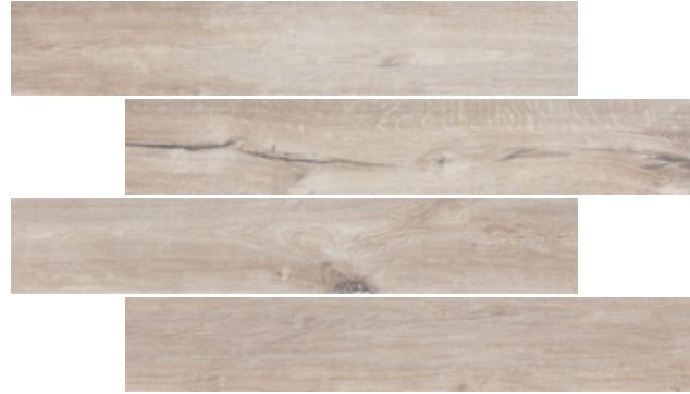
8x48 NAT RECT | #27059E