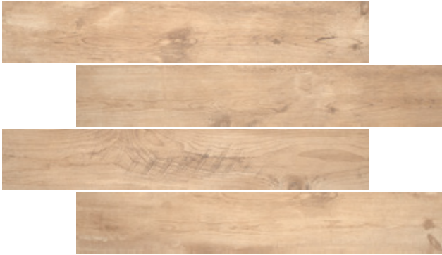
8x48 NAT RECT | #28605E