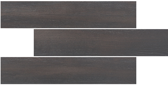
8x40 NAT BOLD | #79059ET