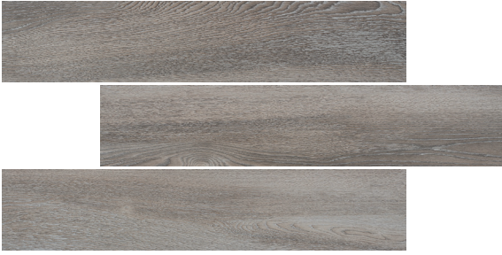
8x40 NAT BOLD | #79061ET