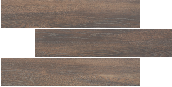
8x40 NAT BOLD | #79060ET