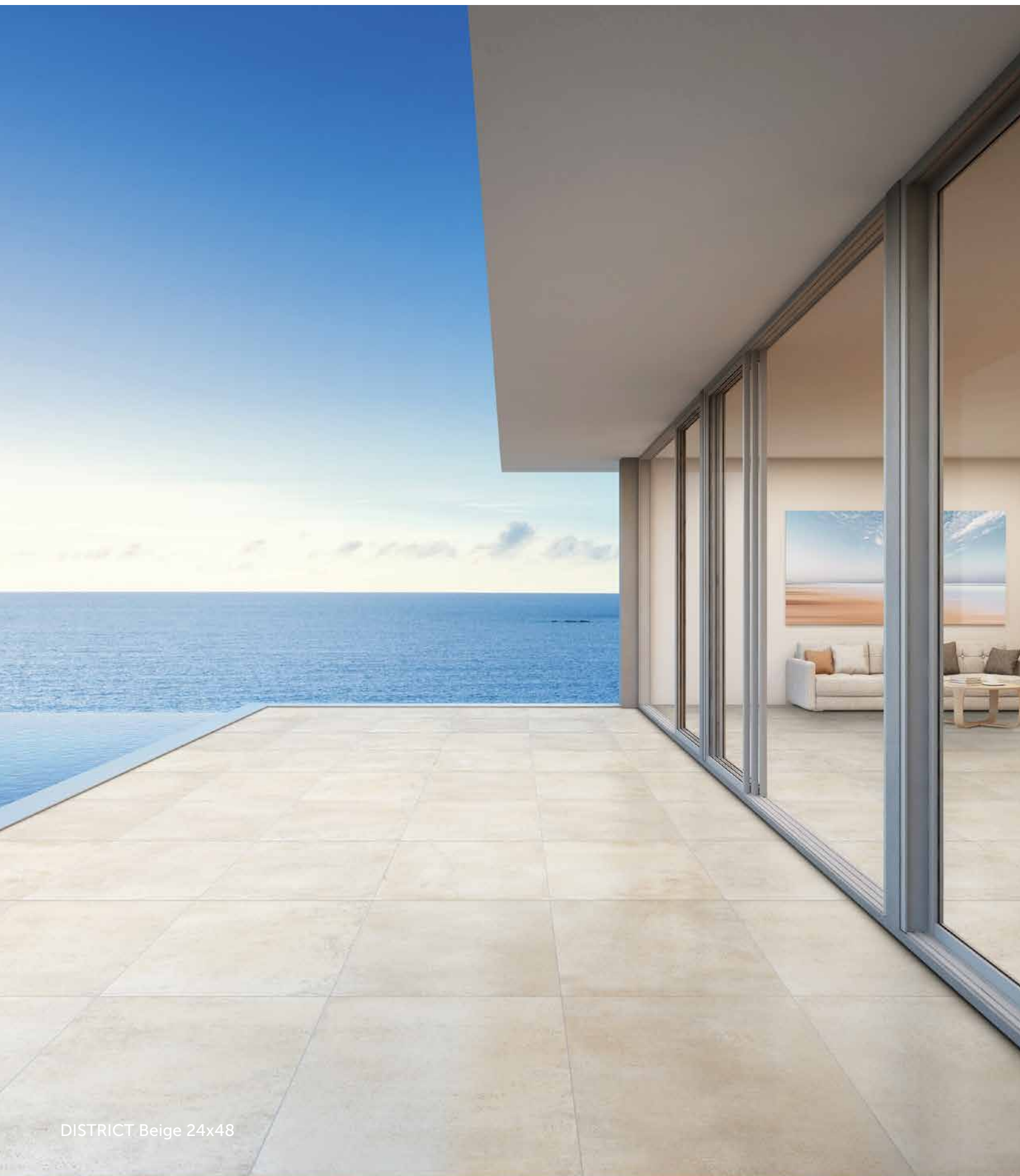
DISTRICT Beige 24x48