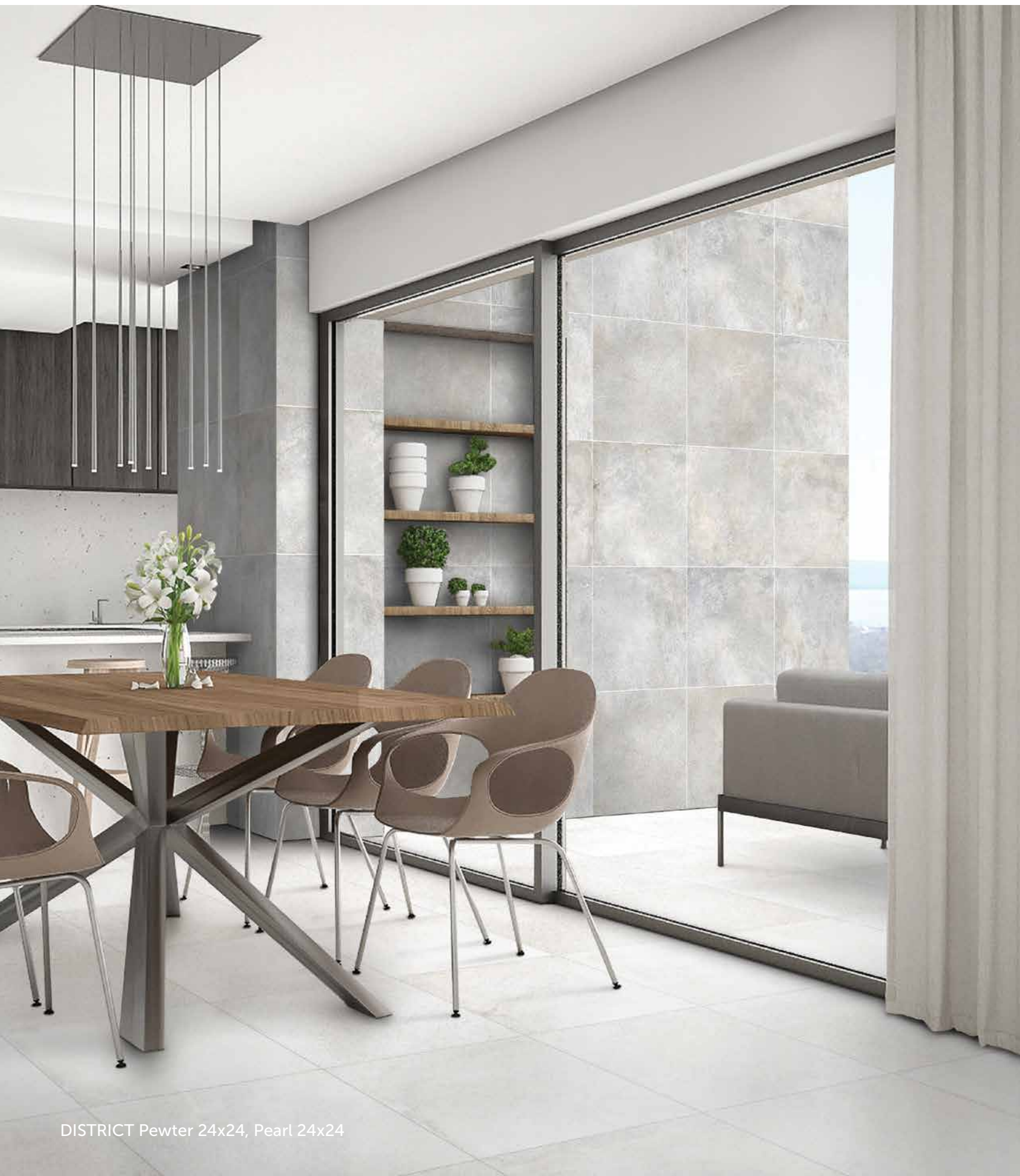
DISTRICT Pewter 24x24, Pearl 24x24