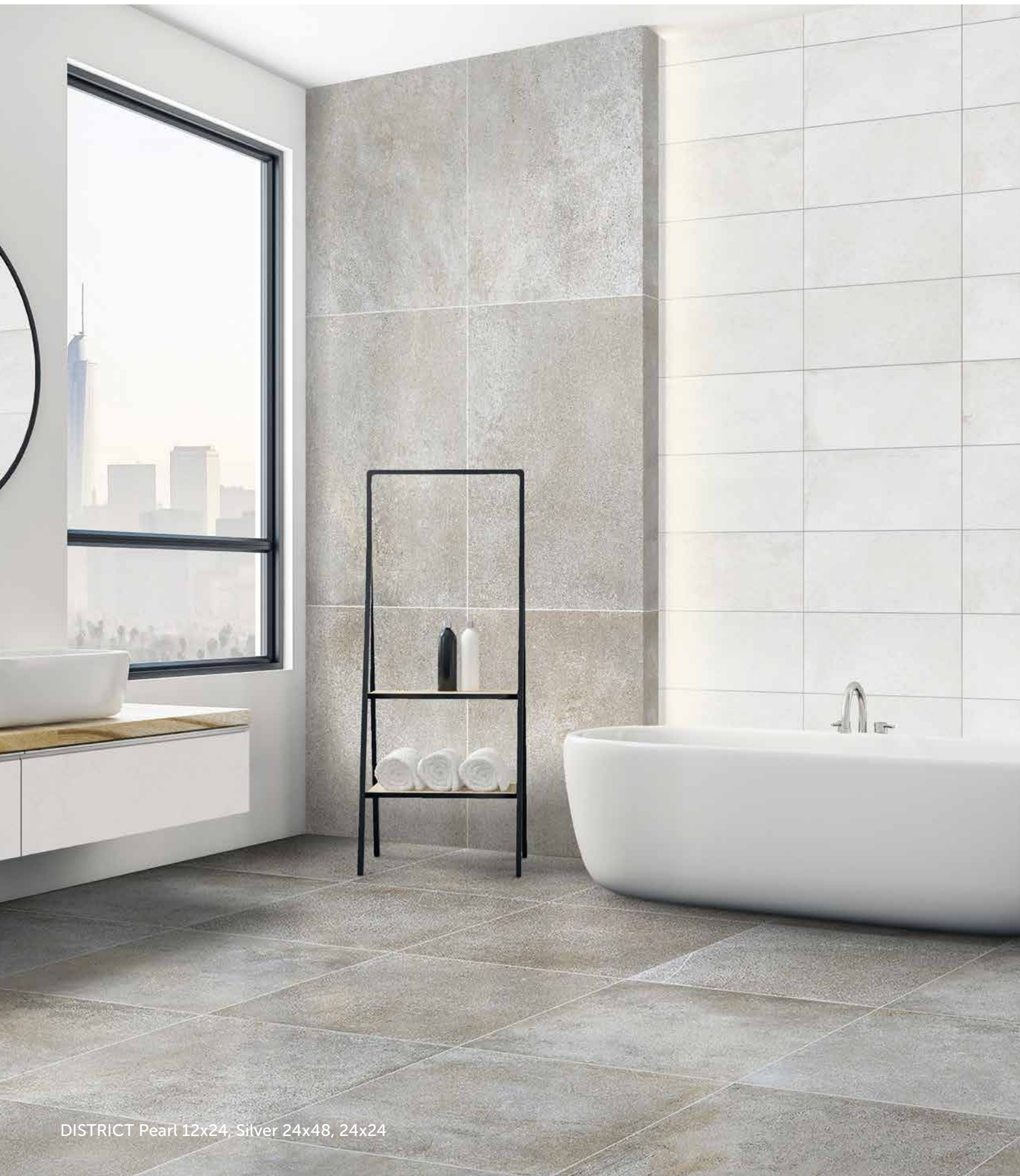
DISTRICT Pearl 12x24, Silver 24x48, 24x24