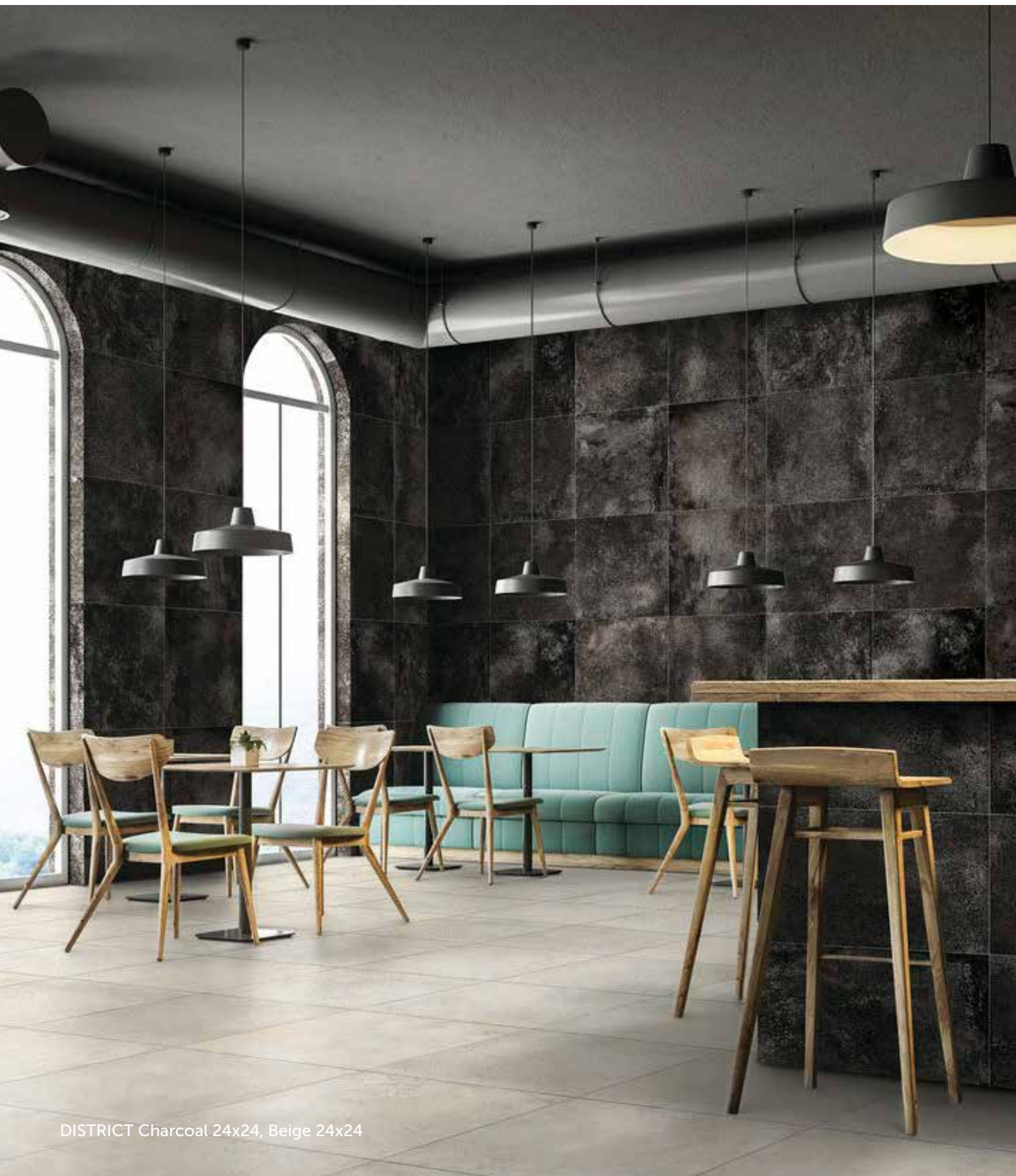
DISTRICT Charcoal 24x24, Beige 24x24