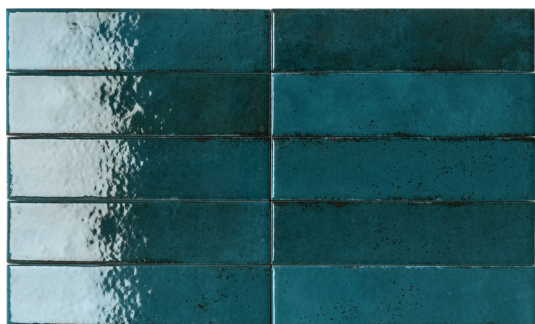
Stagno (10 Piece Panel)