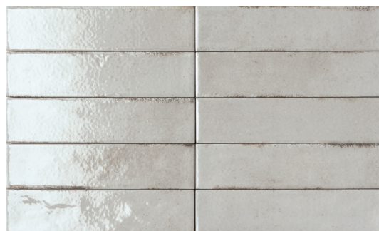
Argilla (10 Piece Panel)