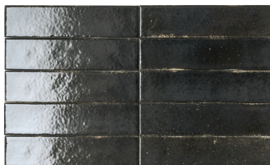
Pepe (10 Piece Panel)