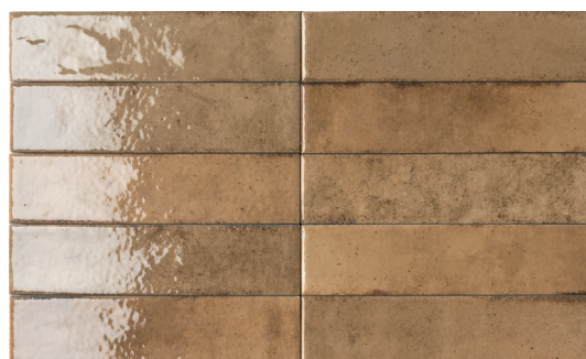
Cedro (10 Piece Panel)