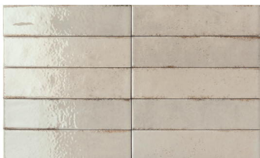
Cannella (10 Piece Panel)