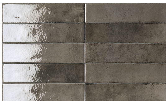
Visone (10 Piece Panel)