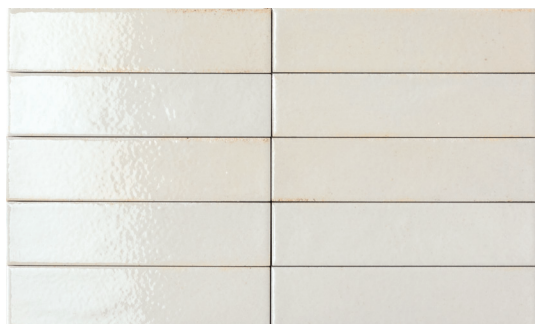
Latte (10 Piece Panel)