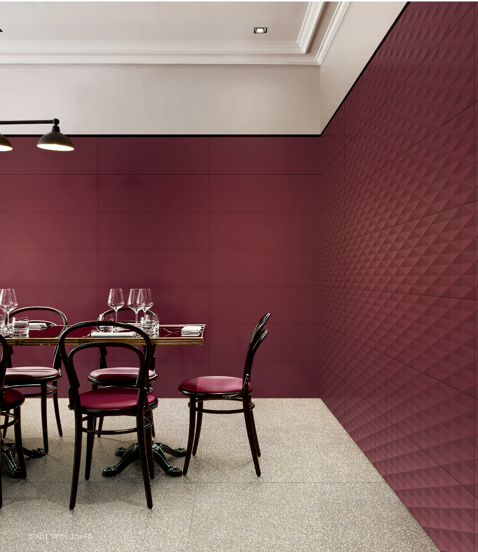
BIXBY Wine 16x48