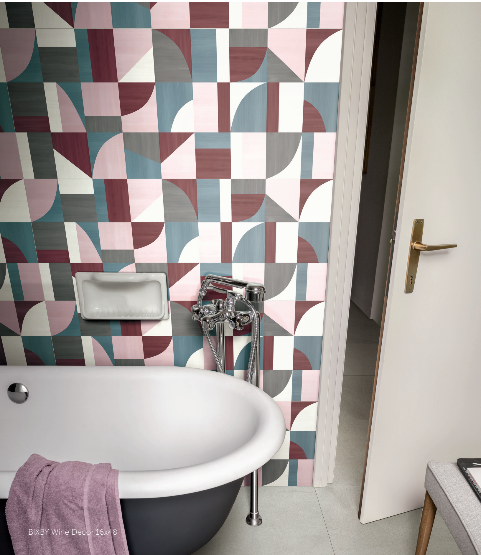
BIXBY Wine Decor 16x48