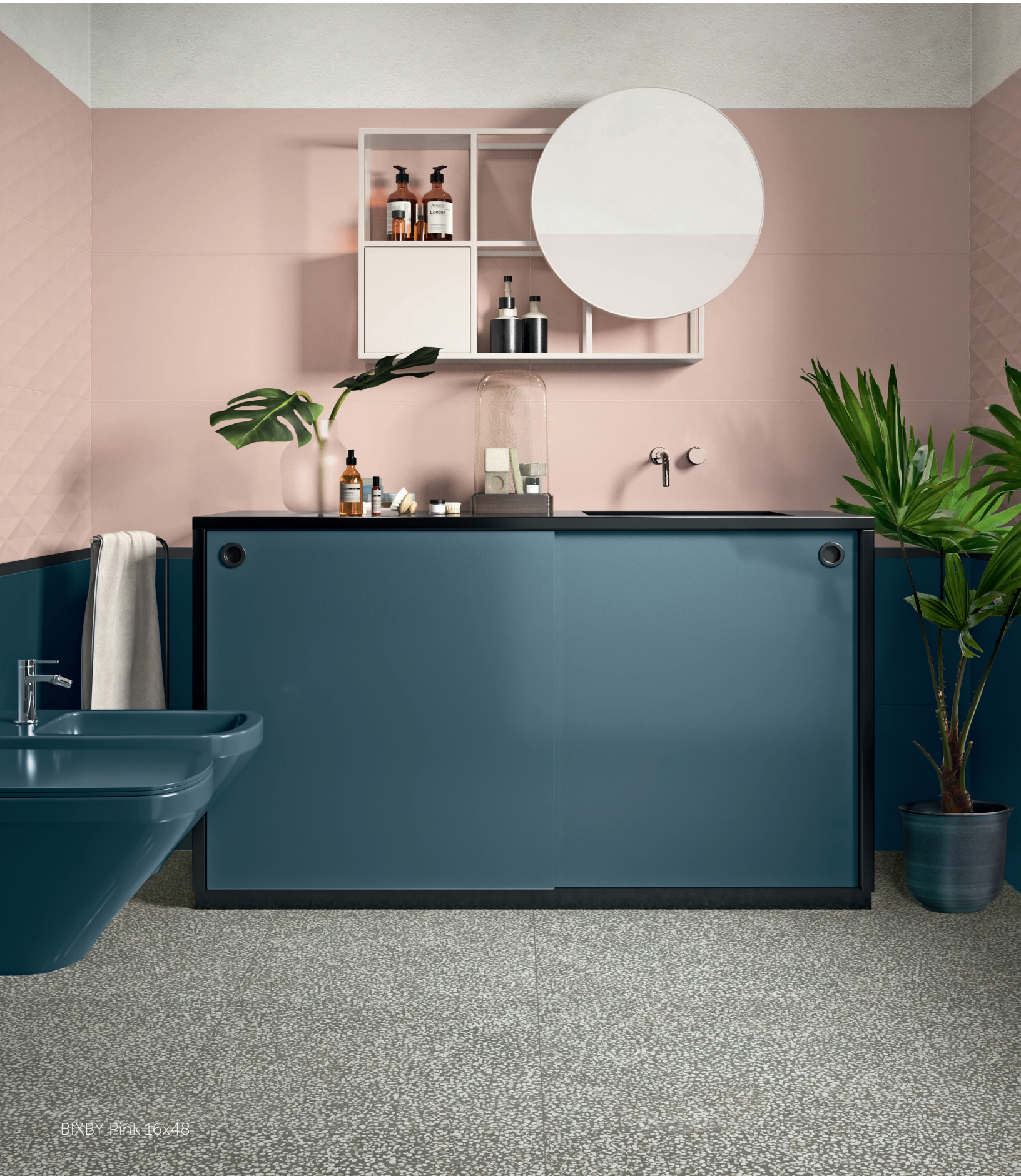
BIXBY Pink 16x48