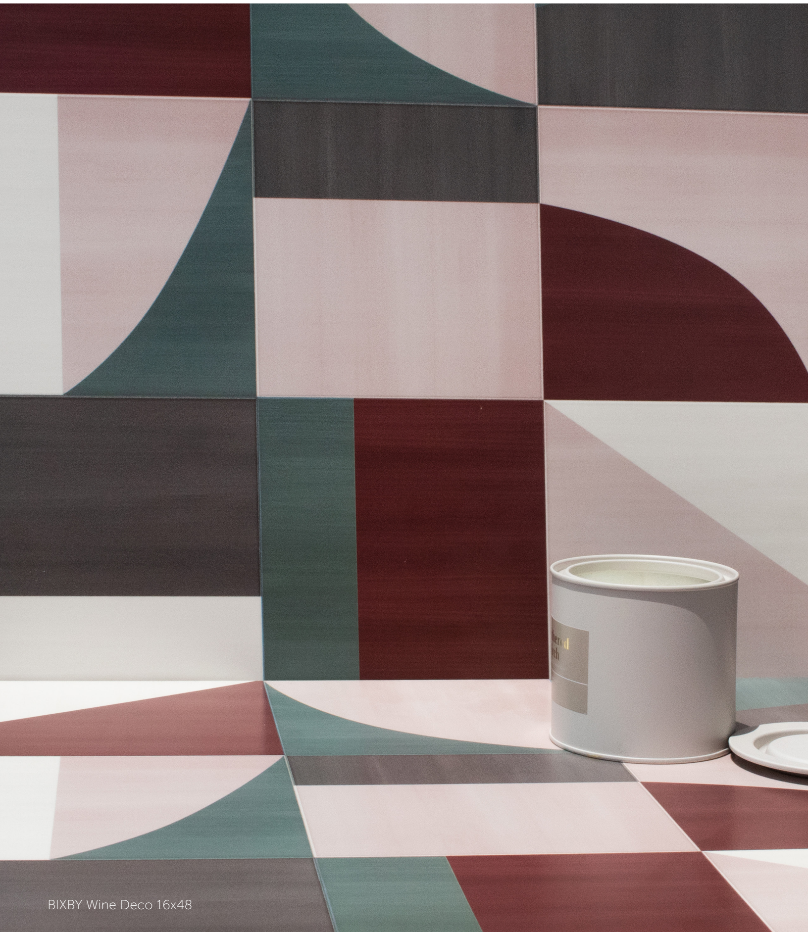
BIXBY Wine Deco 16x48