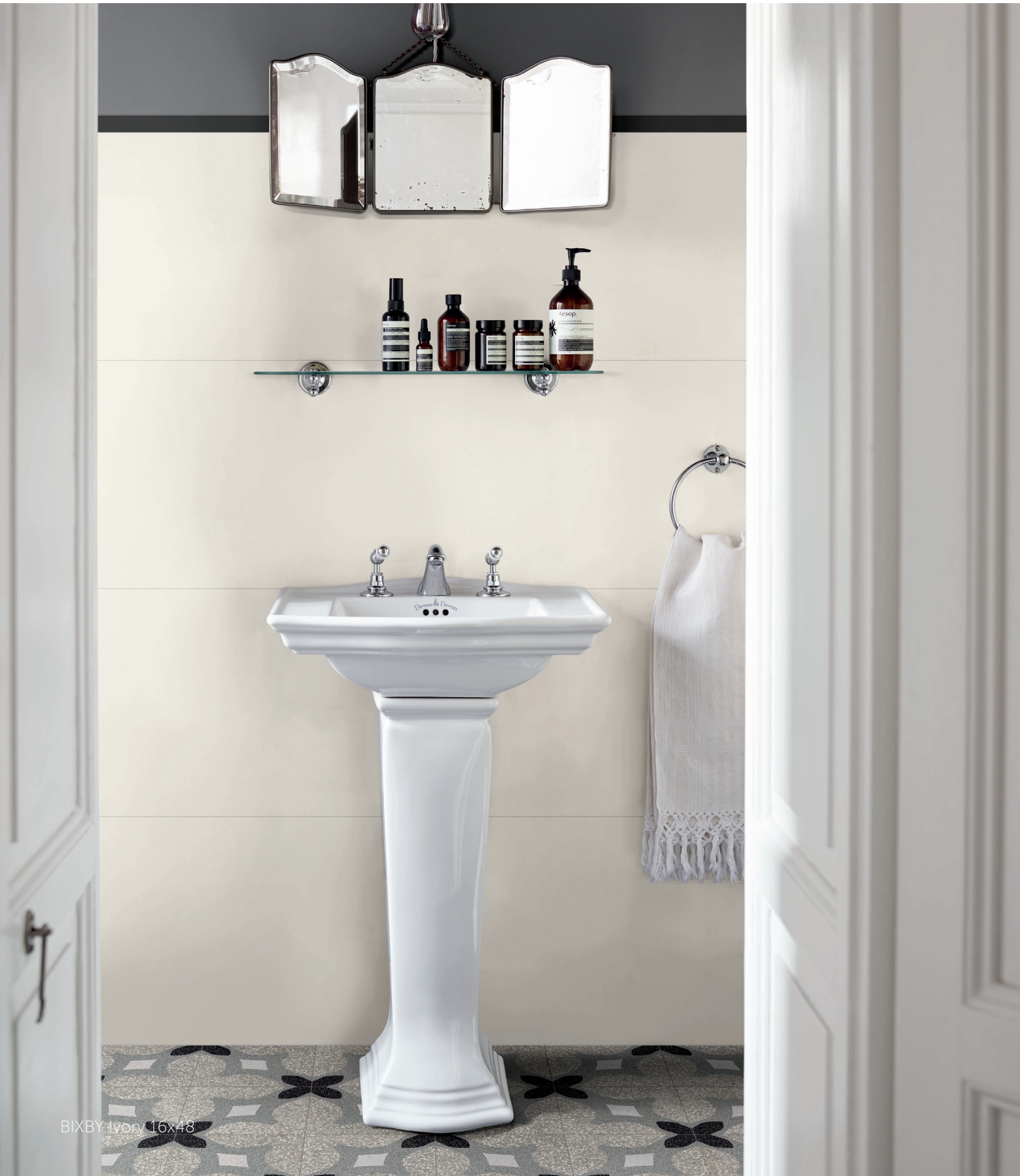
BIXBY Ivory 16x48