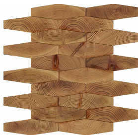
Long Hex 3D 11" x 13" (0.99 SF/Sheet)