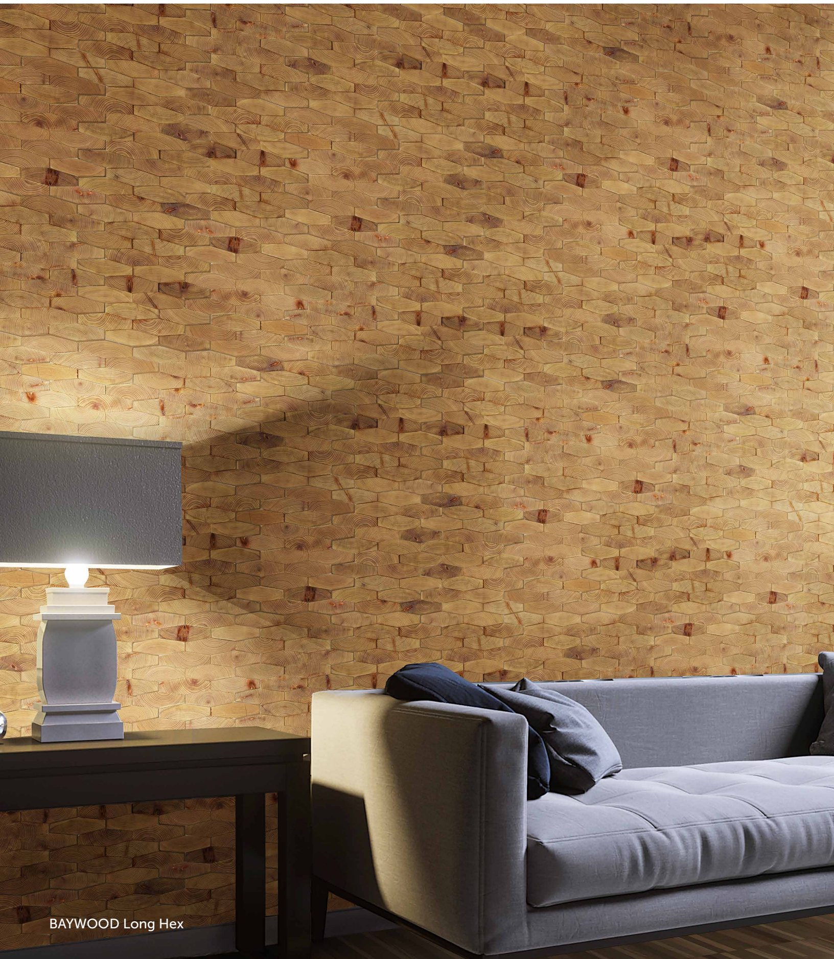
BAYWOOD Long Hex