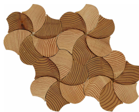
Pinwheel 3D 10.5" x 12" (0.88 SF/Sheet)