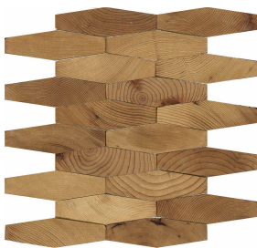
Long Hex 11" x 13" (0.99 SF/Sheet)