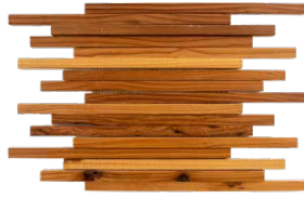
Voluspa 3D 10.51" x 13.58" (0.99 SF/Sheet)