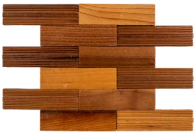
Metro 11.97" x 11.97" (0.99 SF/Sheet)