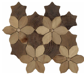
Mytosis 11" x 13" (1 SF/Sheet)