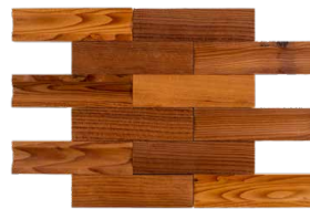
Tunnelio 11.97" x 11.97" (0.99 SF/Sheet)