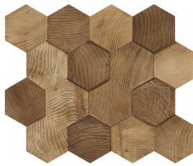
Standard Hex 3D 11" x 12.5" (0.93 SF/Sheet)