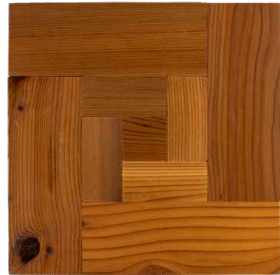
Milano 12" x 12" (1 SF/Sheet)