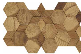
Star 9.25" x 16" (1.04 SF/Sheet)