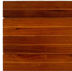
Lodge 12" x 12" (1 SF/Sheet)