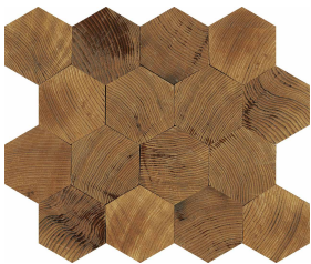
Standard Hex 11" x 12.5" (0.93 SF/Sheet)