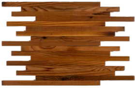
Voluspa 10.51" x 13.58" (0.97 SF/Sheet)