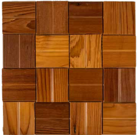
Cascades 12" x 12" (1 SF/Sheet)