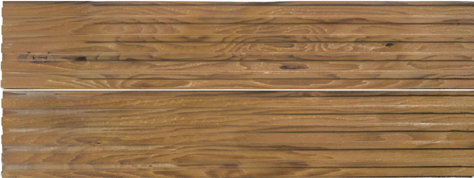
Channel 3.86" x 19.69"