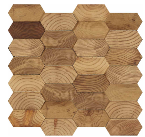
Honeycomb 3D 12" x 12.5" (1.03 SF/Sheet)