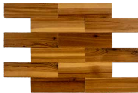
Subway 11.97" x 11.97" (0.99 SF/Sheet)