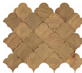
Scallop 11" x 13.25" (1.01 SF/Sheet)