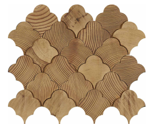
Scallop 3D 11" x 13.25" (1.01 SF/Sheet)