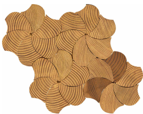
Pinwheel 10.5" x 12" (0.88 SF/Sheet)