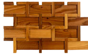
Puzzle 9.57" x 15.37" (1.02 SF/Sheet)