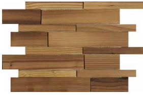
Linear 3D 13.5" x 11.5" (0.99 SF/Sheet)