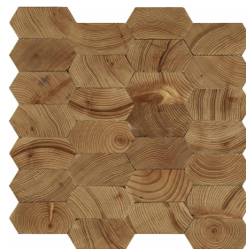
Honeycomb 12" x 12.5" (1.03 SF/Sheet)