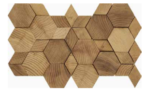
Star 3D 9.25" x 16" (1.04 SF/Sheet)