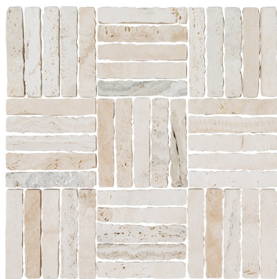
Beige - Parquet Mosaic