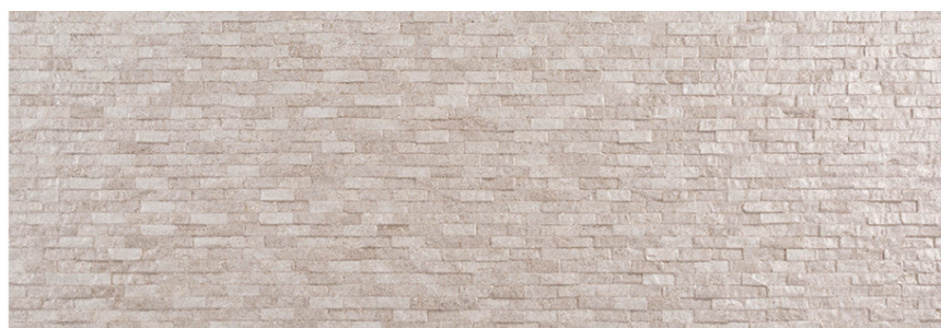
Plateau - 12x35