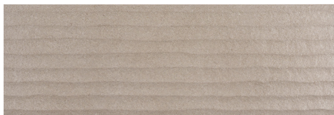
Dunes - 8x24