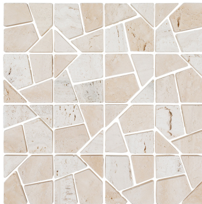
Beige - Terrain Mosaic