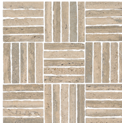
Taupe - Parquet Mosaic