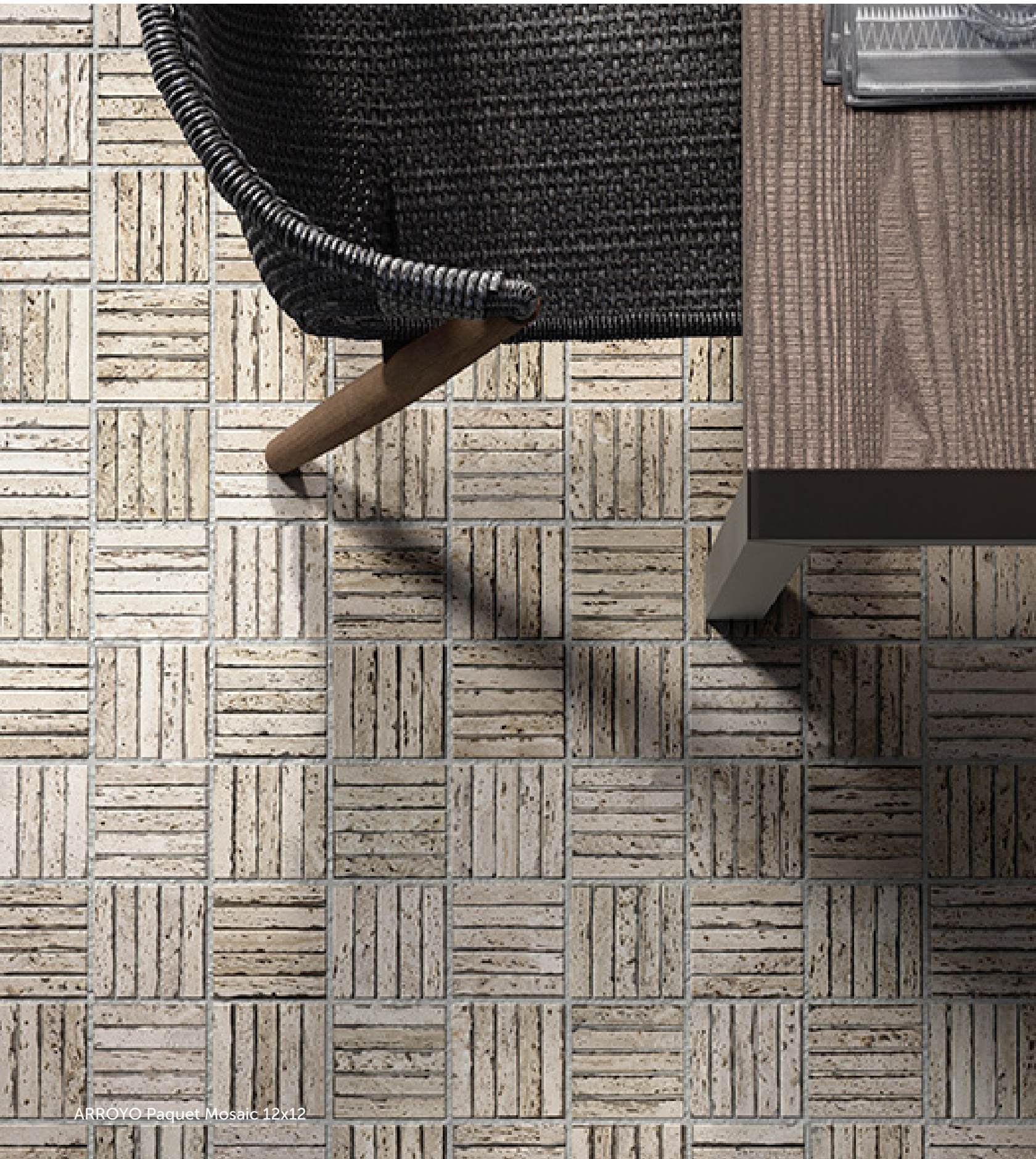
ARROYO Paquet Mosaic 12x12