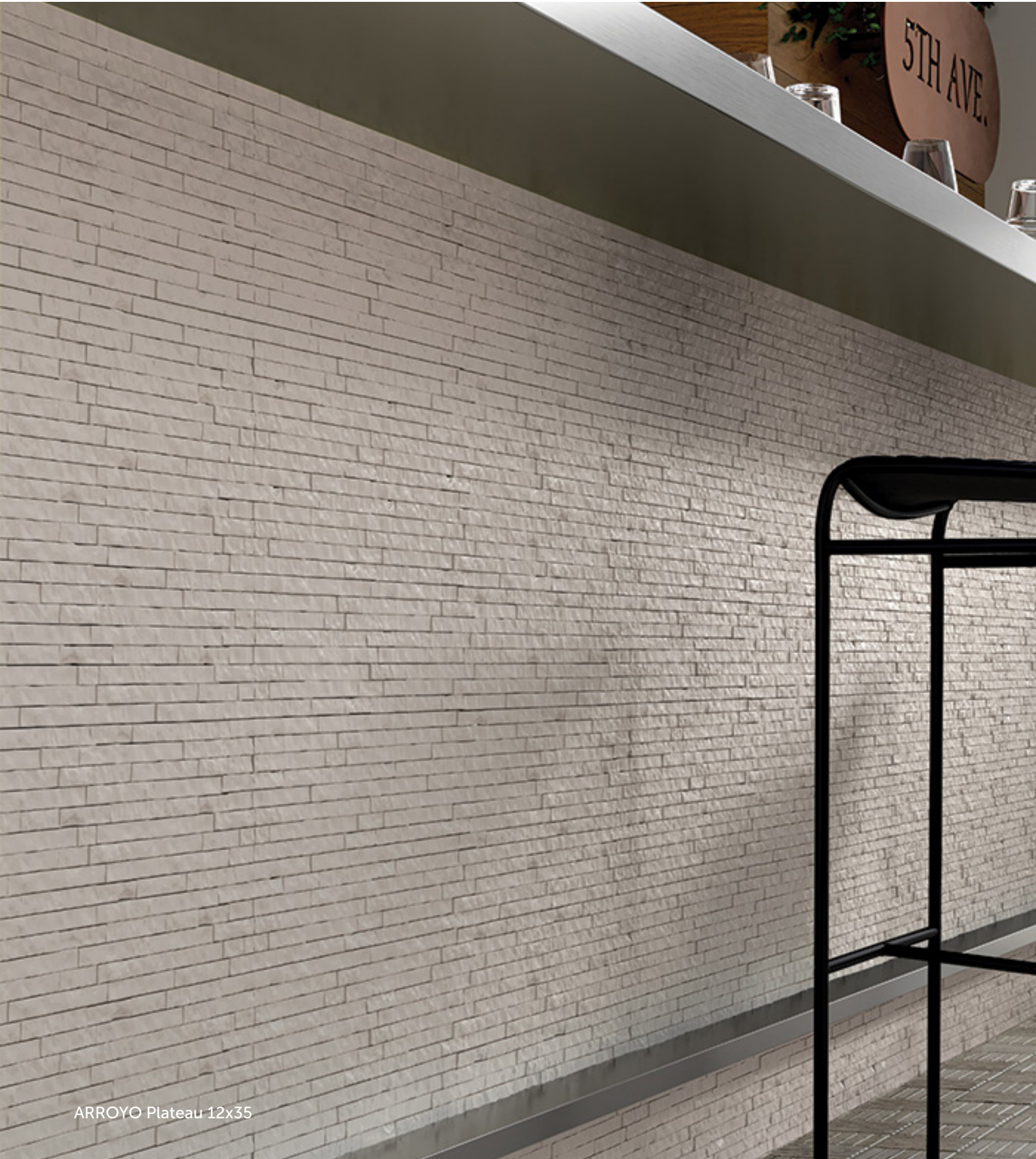
ARROYO Plateau 12x35