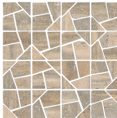
Taupe - Terrain Mosaic