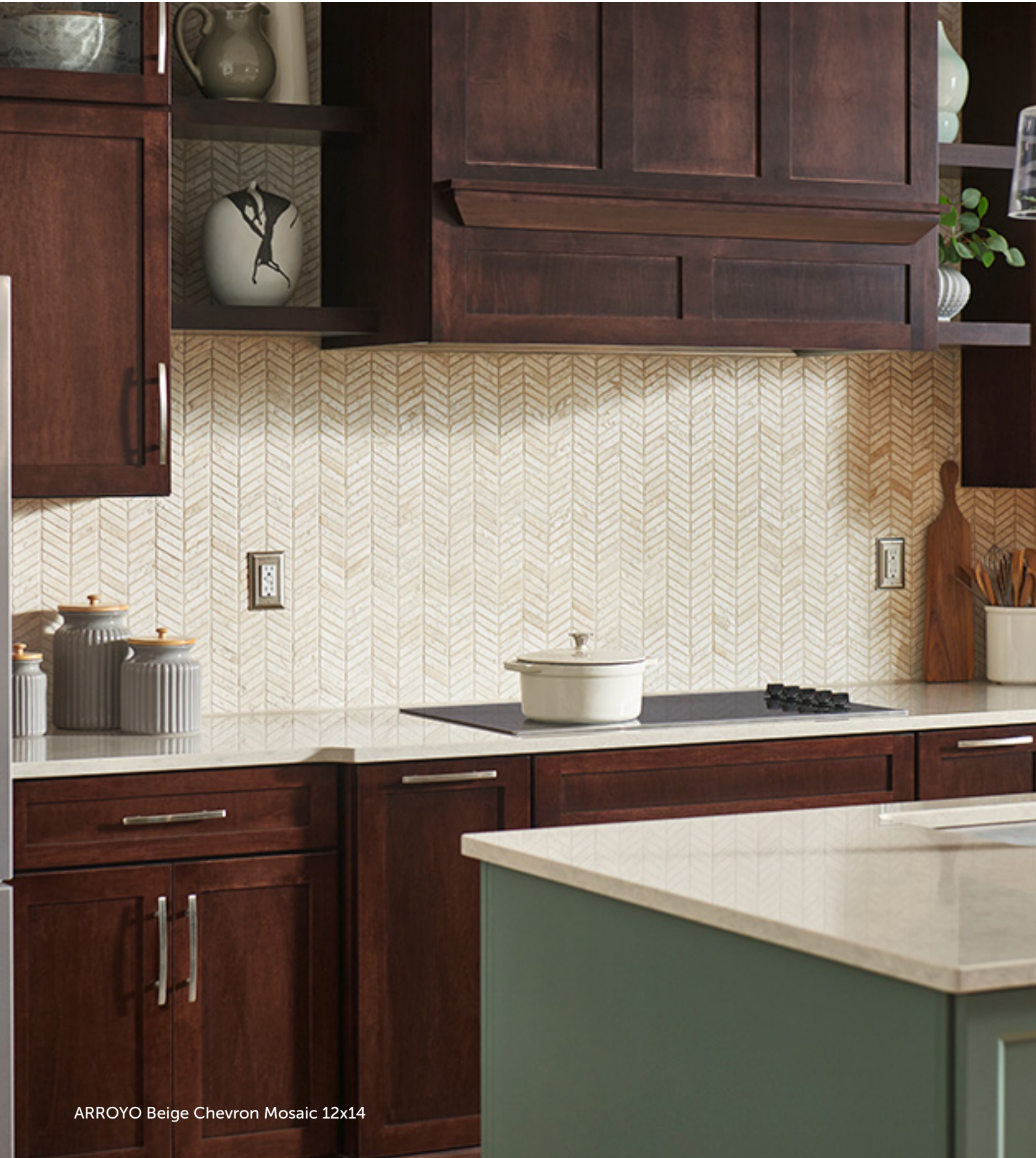
ARROYO Beige Chevron Mosaic 12x14