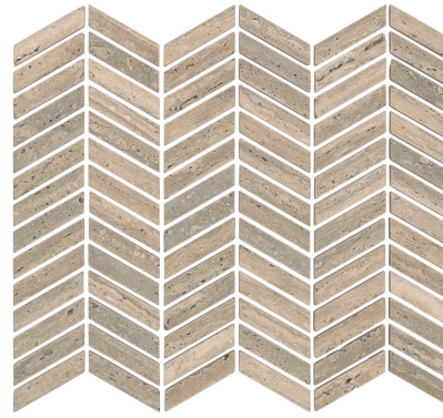
Taupe - Chevron Mosaic