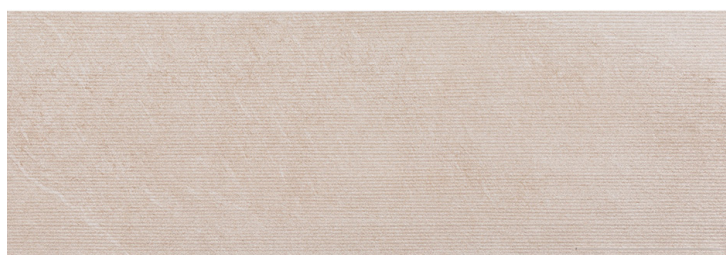
Oasis - 9.5x27