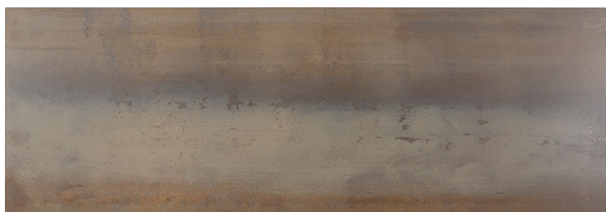
Mirage - 12x35