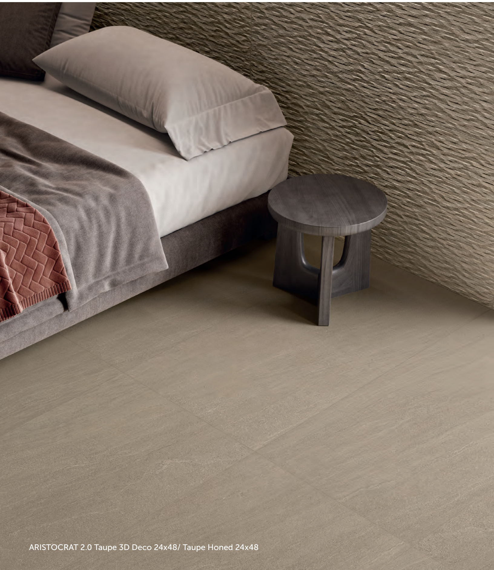
ARISTOCRAT 2.0 Taupe 3D Deco 24x48/ Taupe Honed 24x48