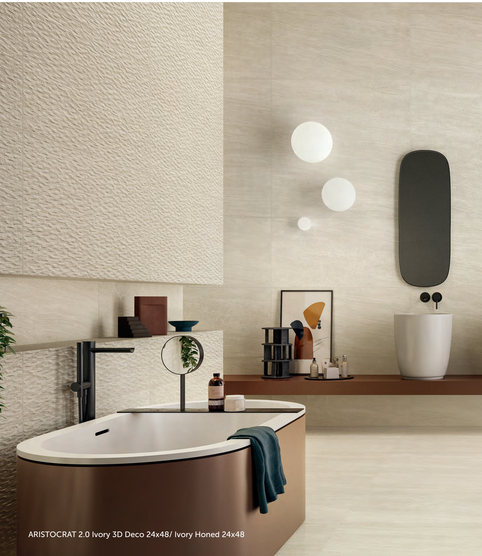
ARISTOCRAT 2.0 Ivory 3D Deco 24x48/ Ivory Honed 24x48