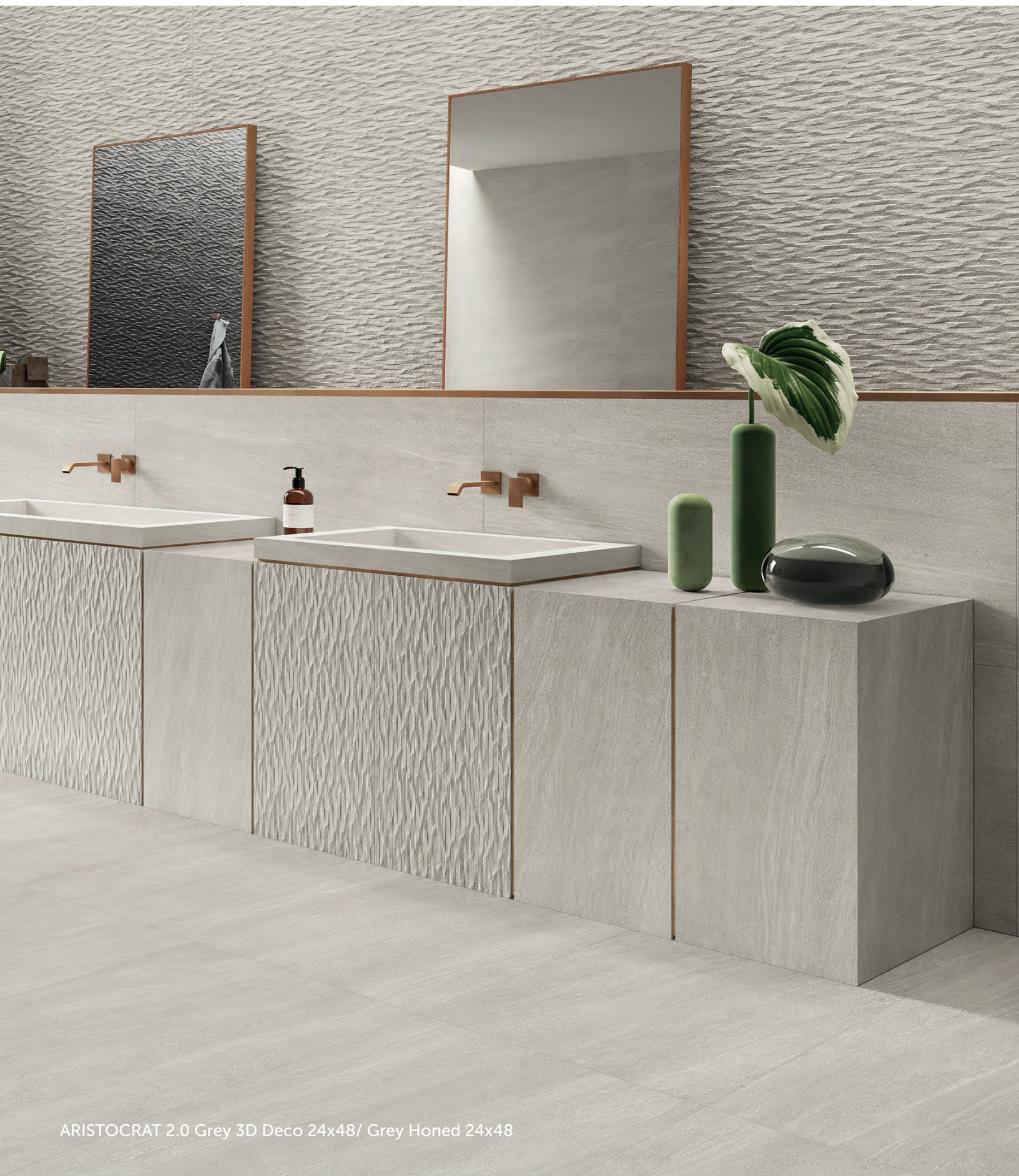
ARISTOCRAT 2.0 Grey 3D Deco 24x48/ Grey Honed 24x48