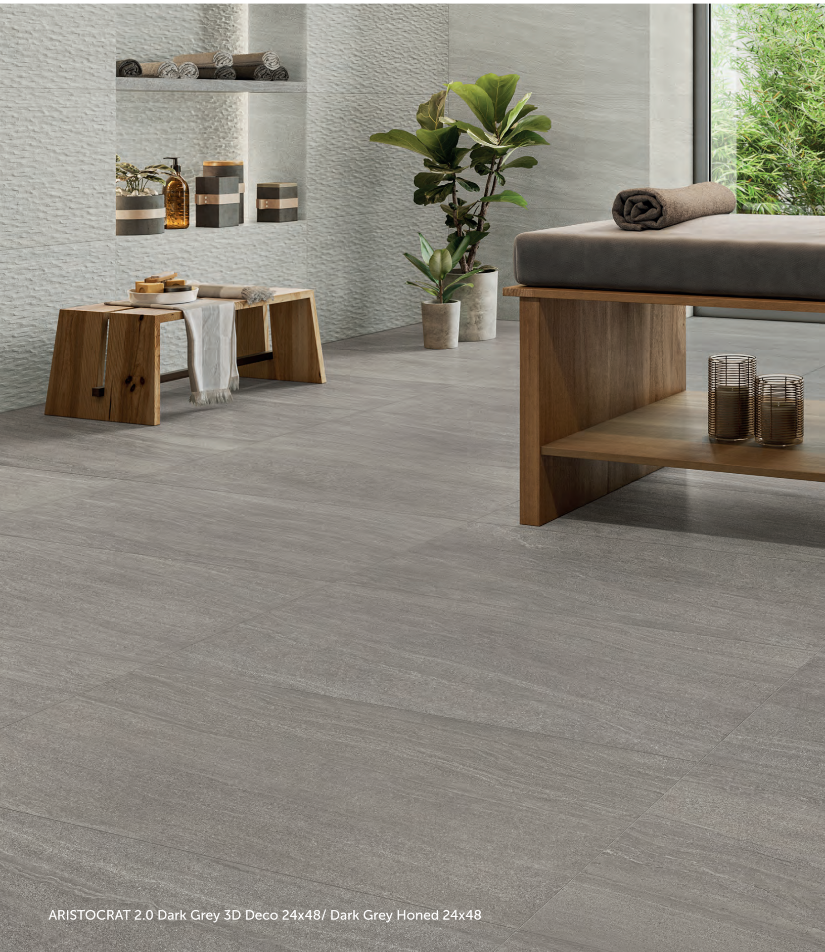
ARISTOCRAT 2.0 Dark Grey 3D Deco 24x48/ Dark Grey Honed 24x48