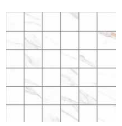
Gold - 2x2