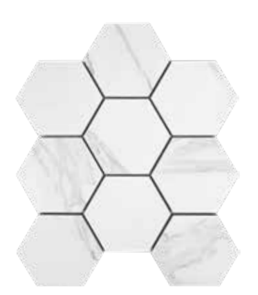
Silver - 4" Hex