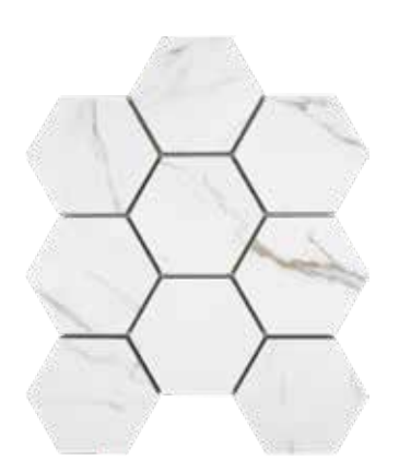
Gold - 4" Hex