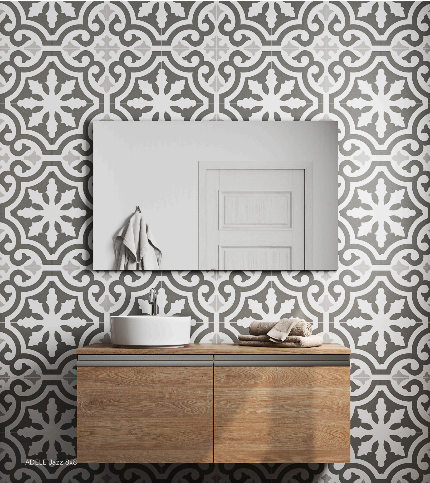
ADELE Jazz 8x8