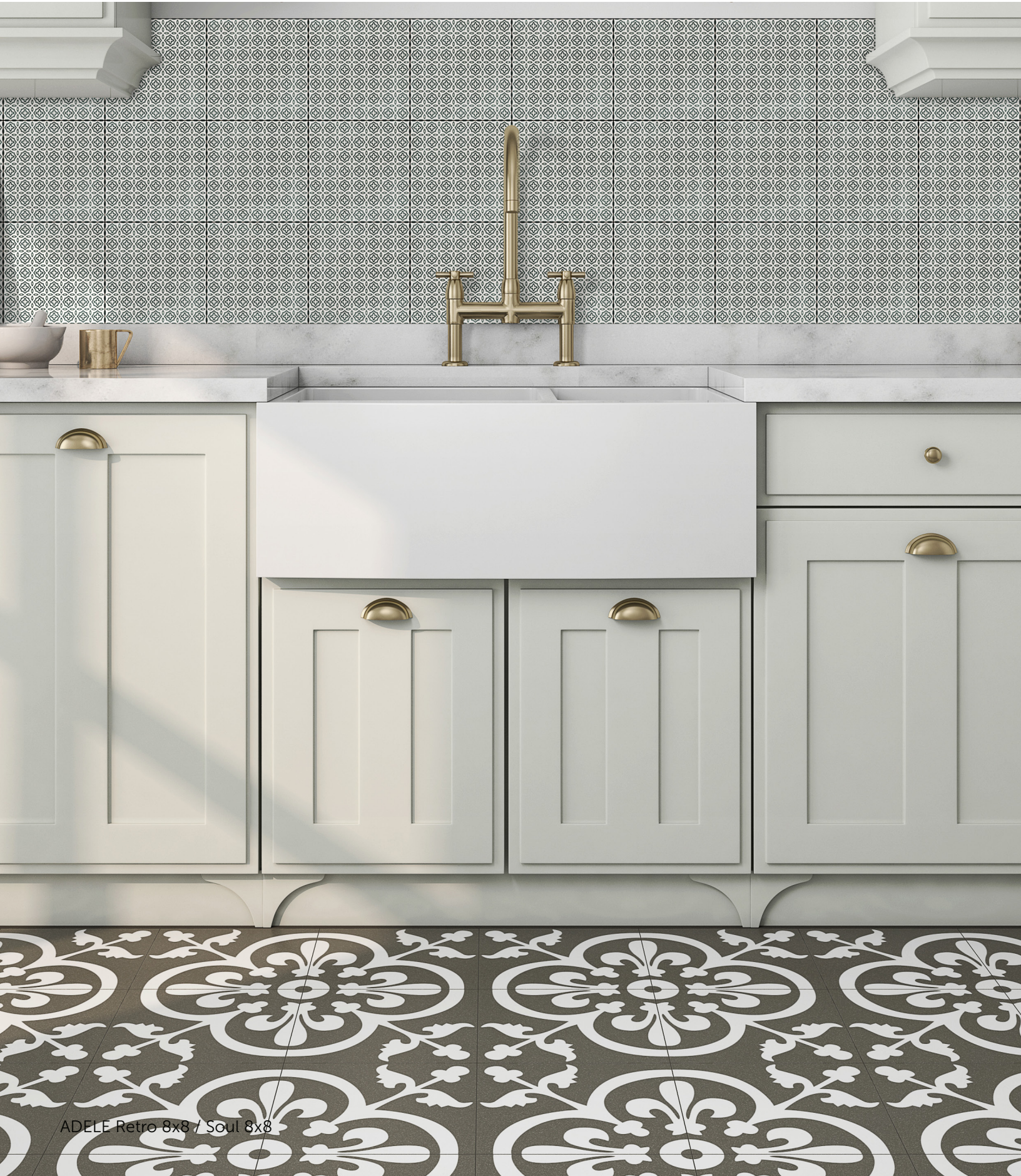
ADELE Retro 8x8 / Soul 8x8