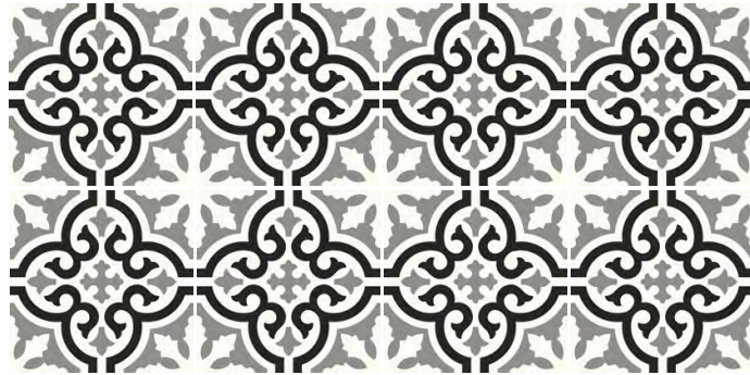
Pattern: 8 pieces