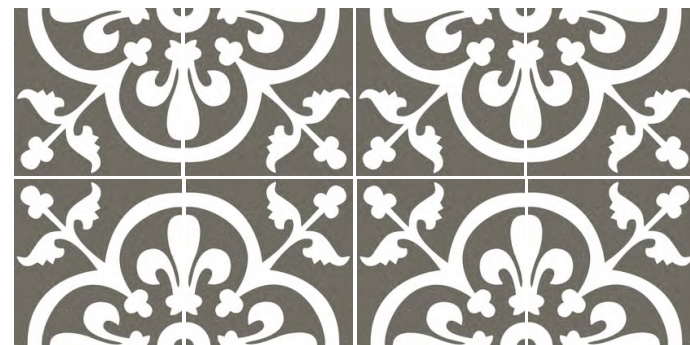
Pattern: 8 pieces