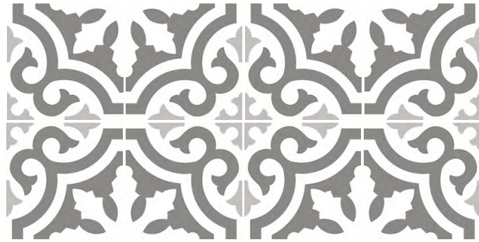
Pattern: 8 pieces