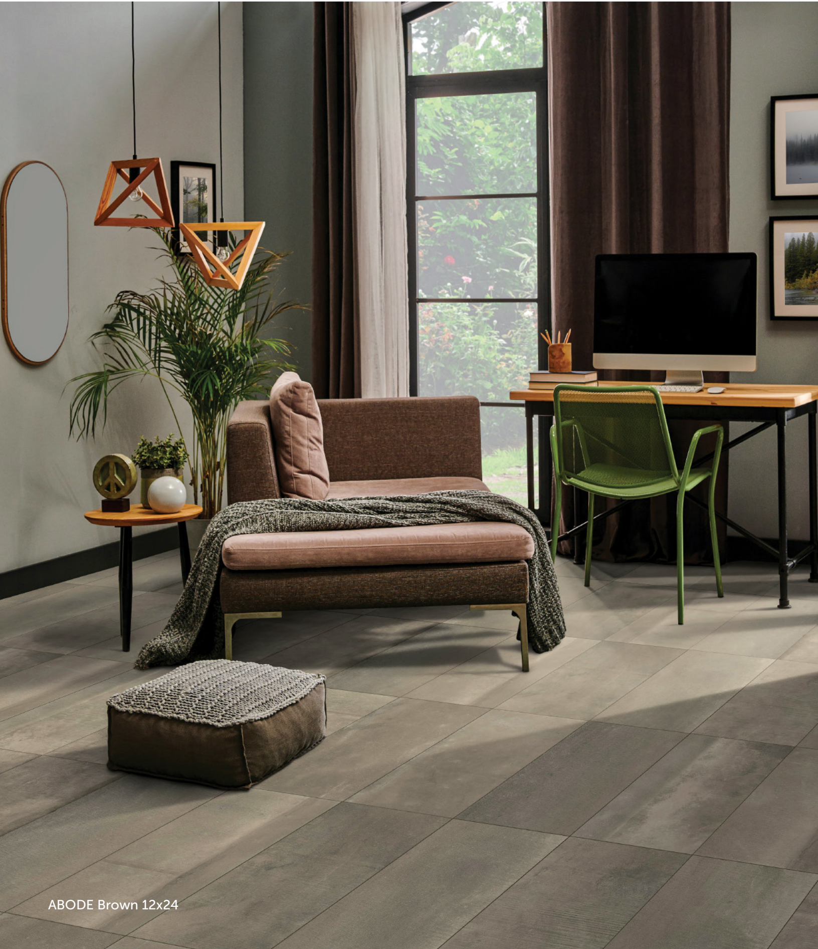
ABODE Brown 12x24