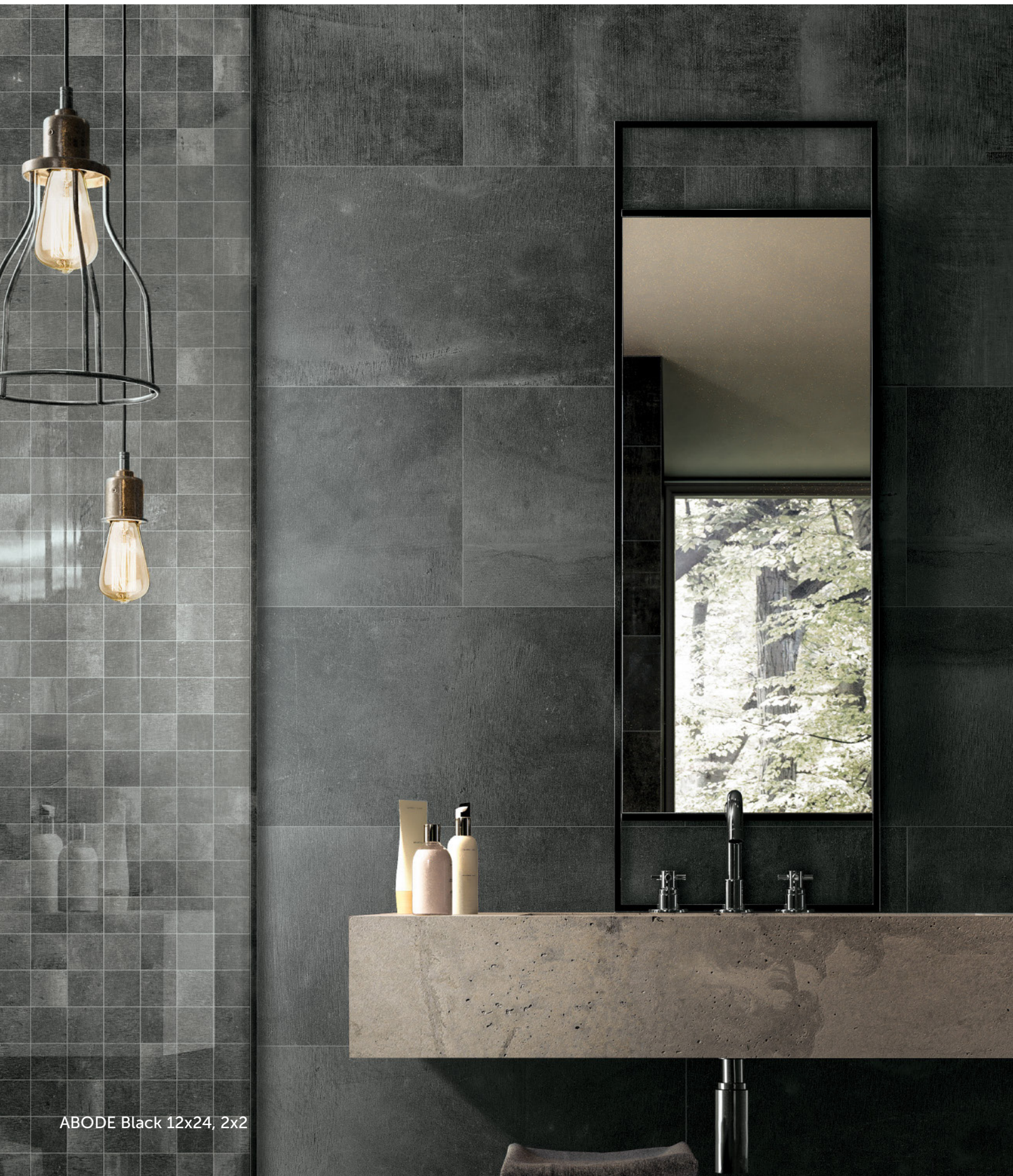
ABODE Black 12x24, 2x2