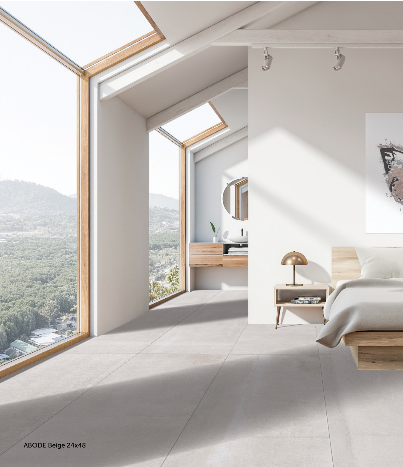
ABODE Beige 24x48