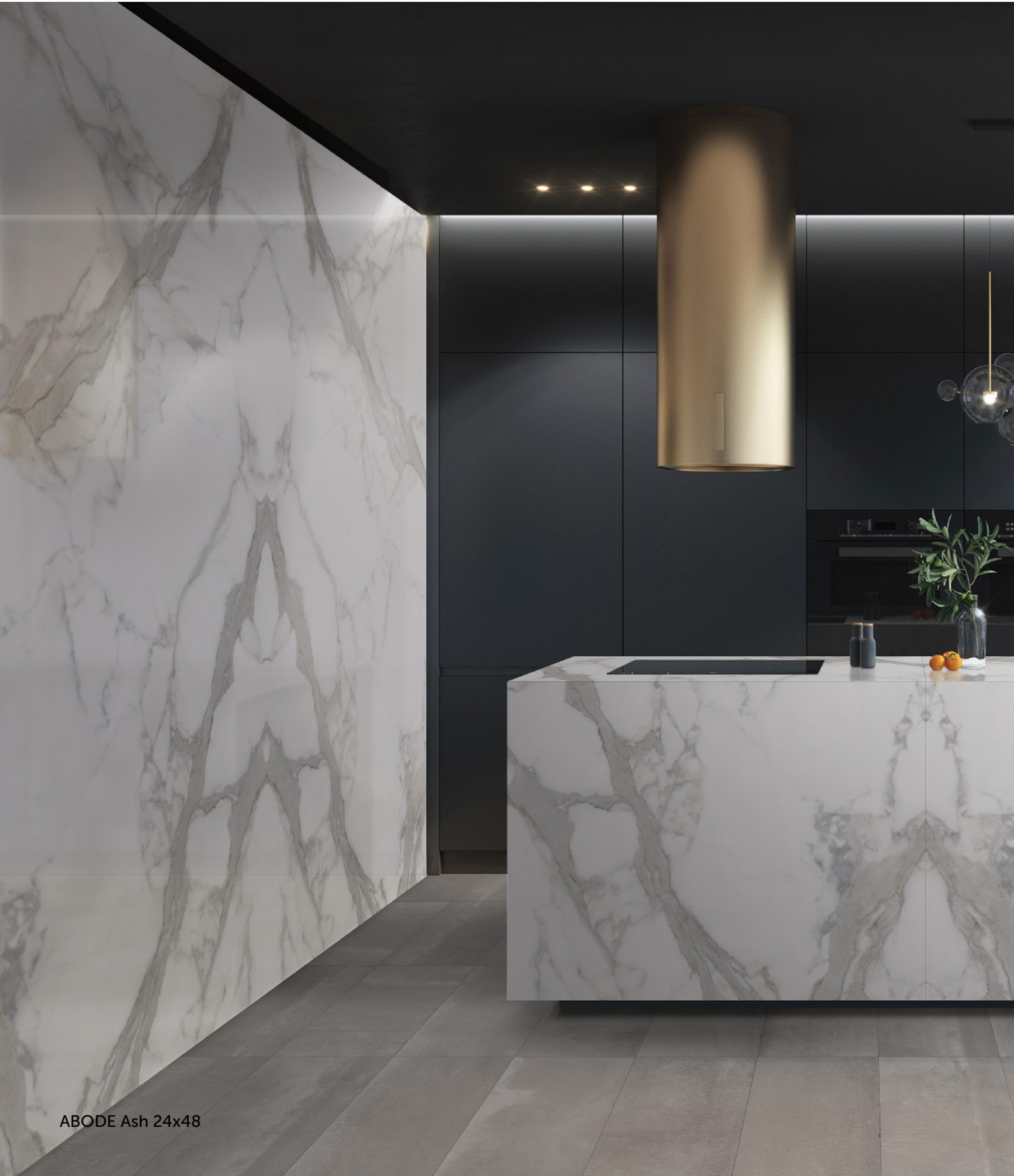
ABODE Ash 24x48