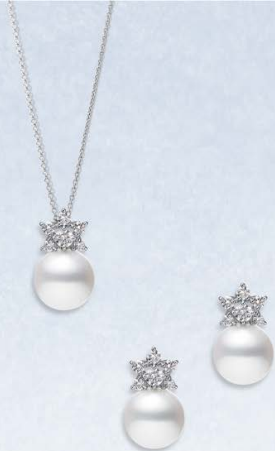
Pendant MPQ10128ADXW US $2,700 Earrings MEQ10143ADXW US $3,450