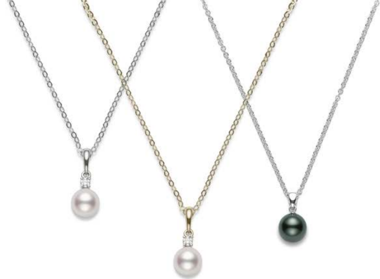
Pendant Left PPS752DW US $1,280 Pendant Center PPS752DK US $1,280 Pendant Right PPS902BDW US $1,790