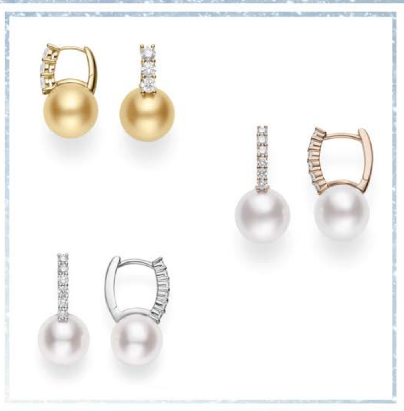
Earrings Top MEA10097GDXX US $2,800 Earrings Middle MEA10228ADXZ US $2,900 Earrings Bottom MEA10228ADXW US $2,900