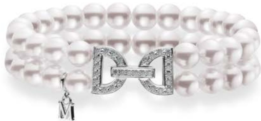
Earrings Left MEA10235ADXW US $8,700 Bracelet MDQ10018ADXW US $7,800