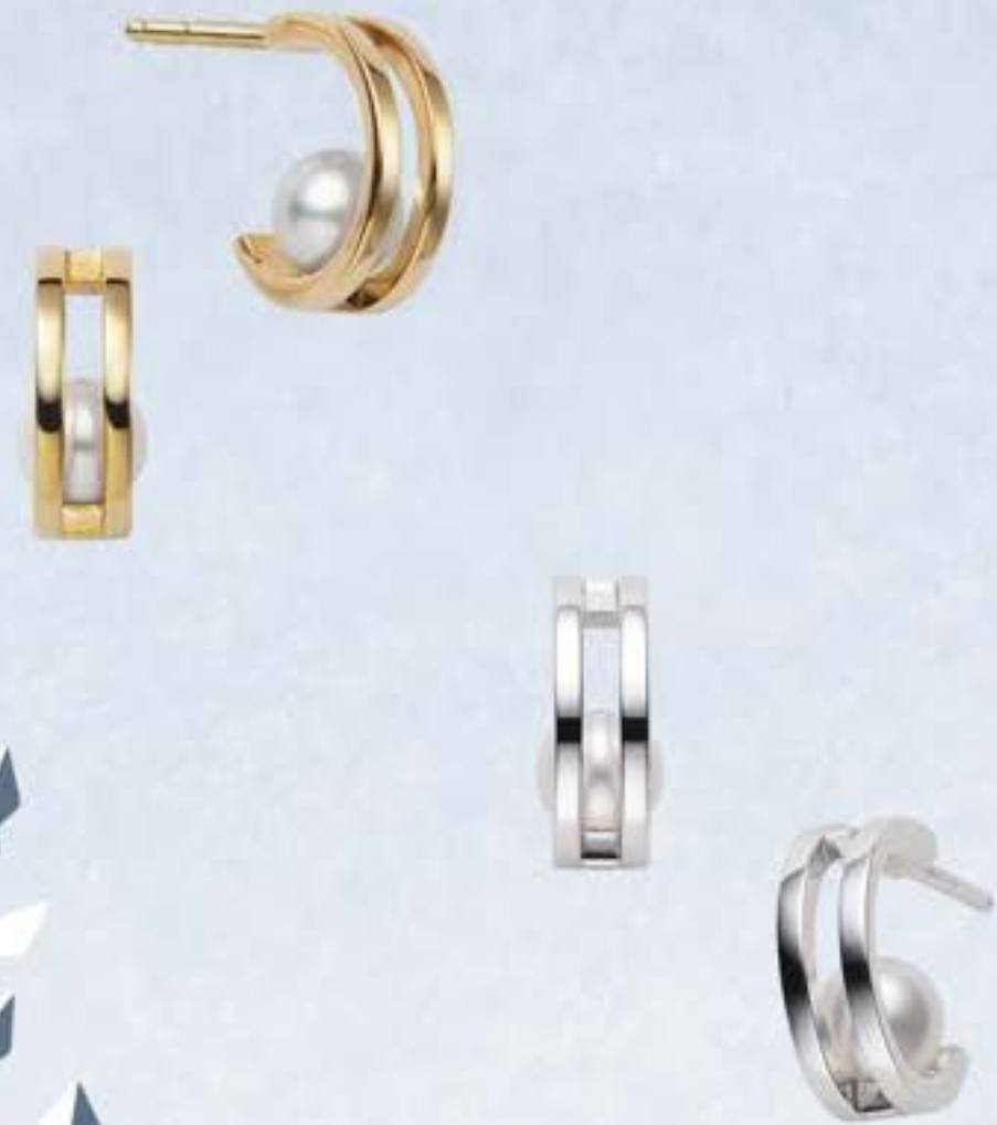
Earrings Left MEQ10160AXXK US $1,300 Earrings Right MEQ10160AXXW US $1,300