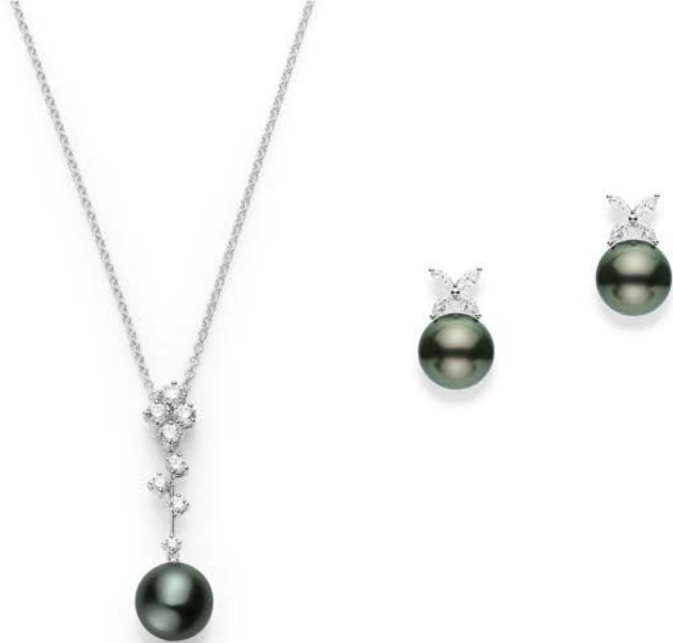
Pendant MPH10002BDXW US $7,500 Earrings MEQ10128BDXW US $7,500