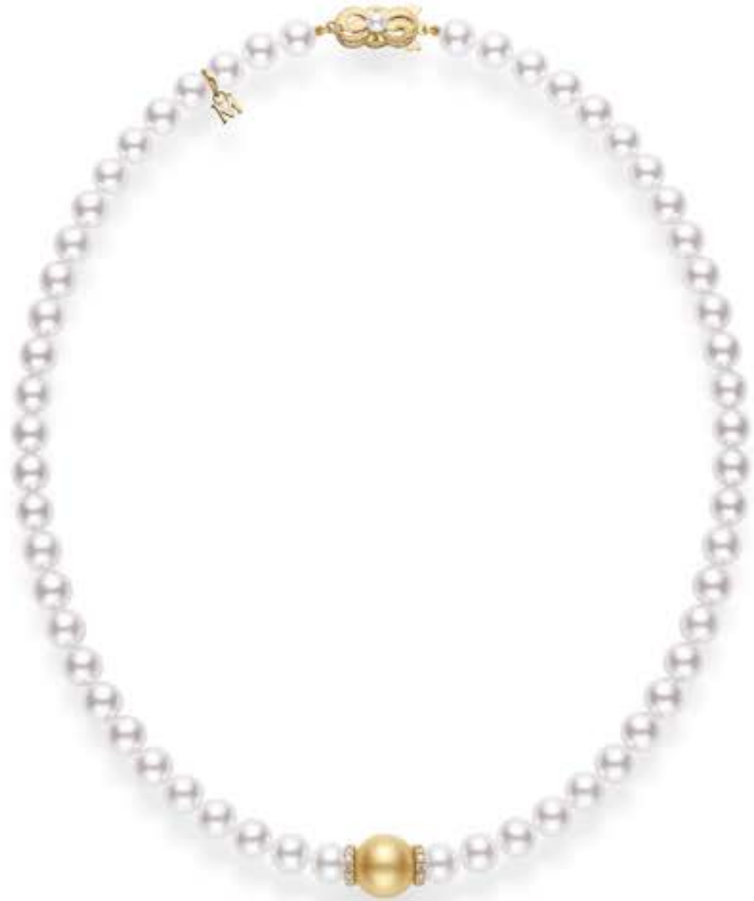
Necklace MZP10122ZDXK US $7,970