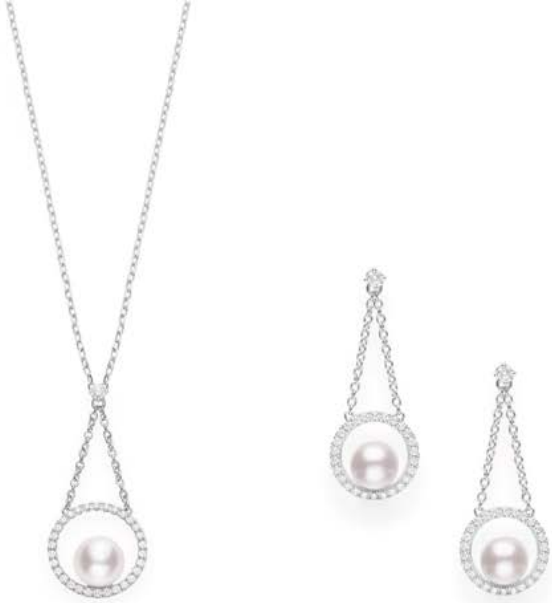
Pendant MPA10370ADXW US $3,100 Earrings MEA10315ADXW US $3,950