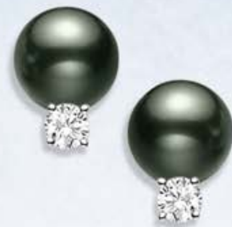
Earrings Left PES702DW - US $1,240 Earrings Right PES802BDW - US $2,270