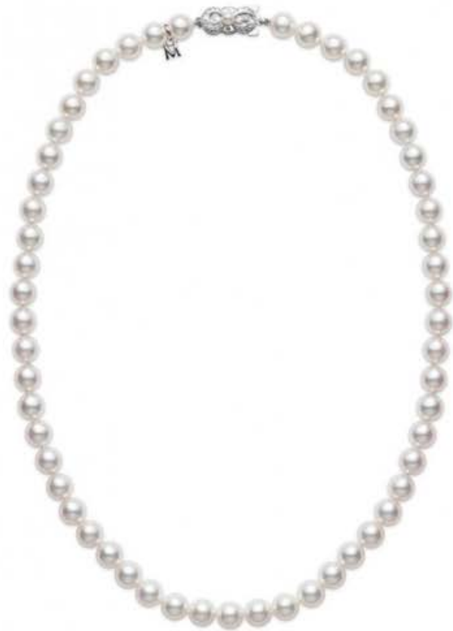
Necklace U70118W US $3,470