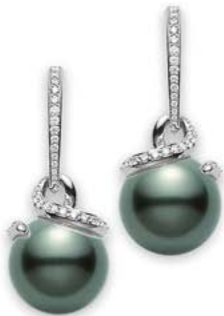
Earrings PEA1054BDW US $8,100