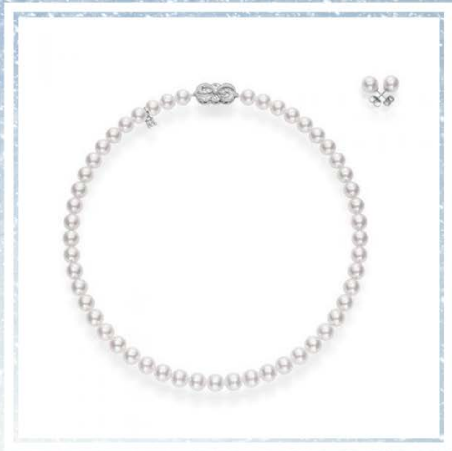
Necklace and Earring Set U85118WJCGS US $10,920