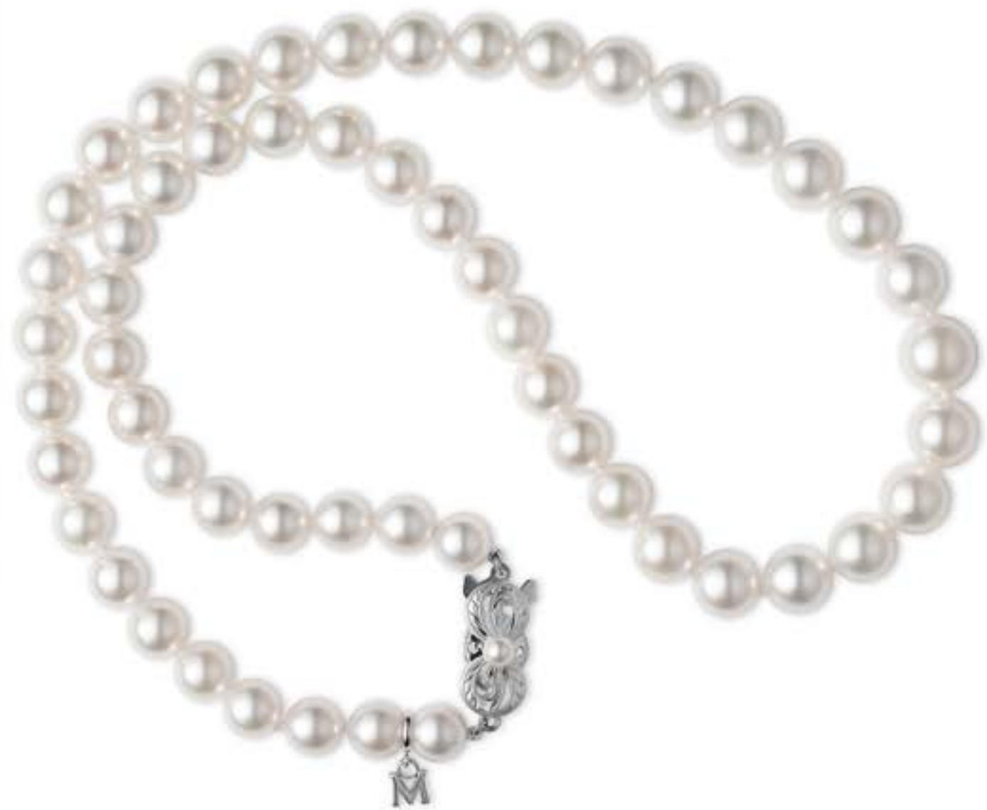
Necklace G90118V1W - US $6,000