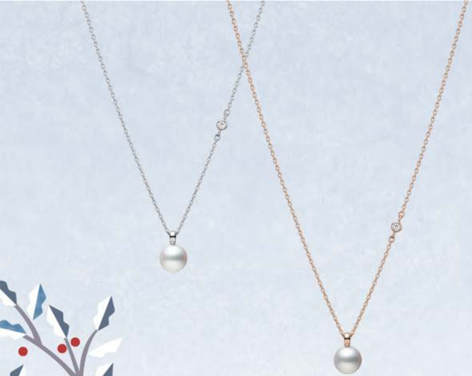
Pendant Left MPQ10159ADXW US $1,600 Pendant Right MPQ10159ADXX US $1,600