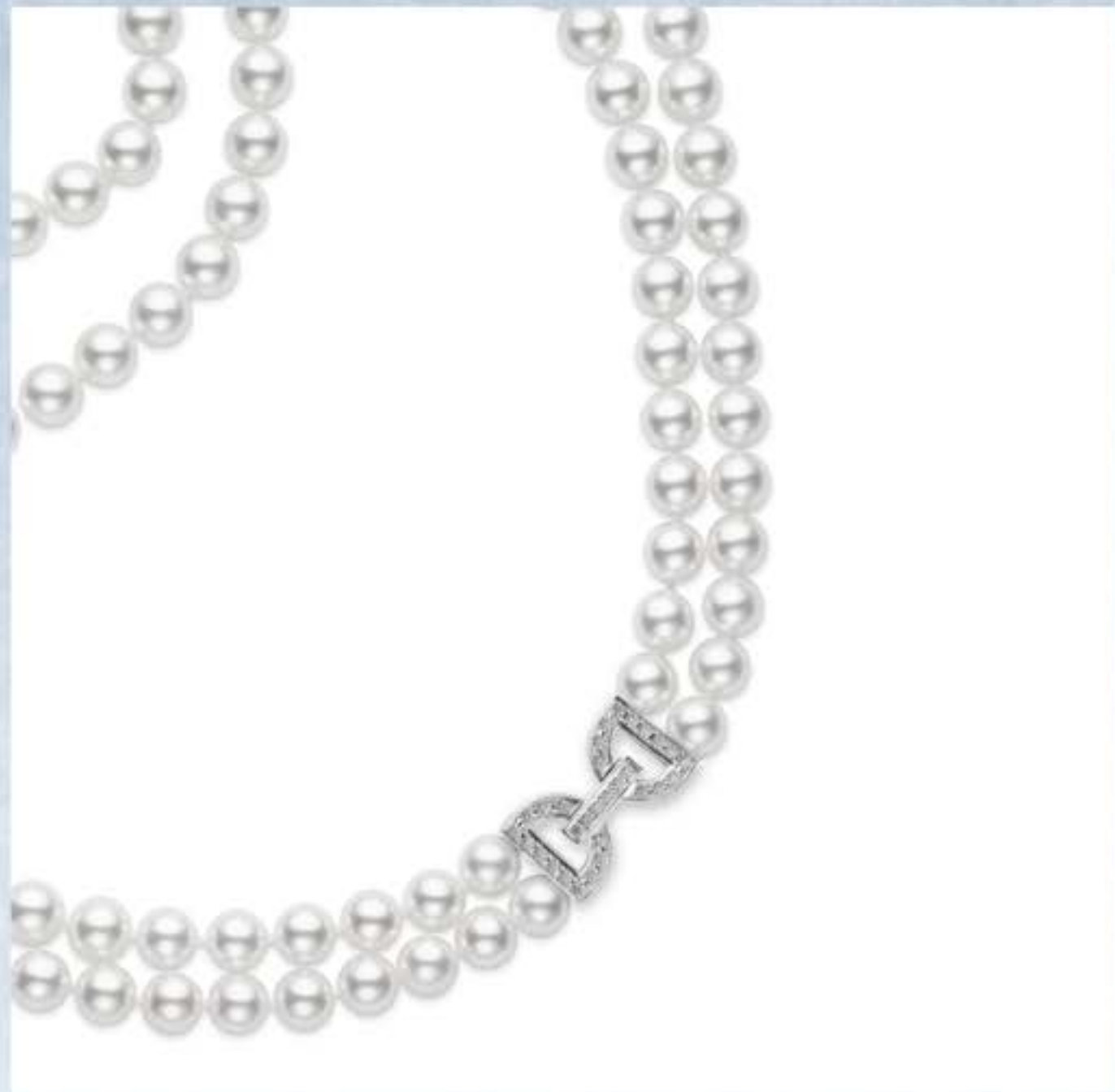
Necklace MZQ10054ADXW US $10,500