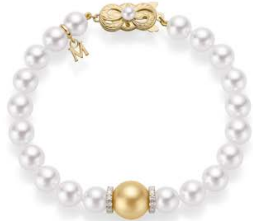
Bracelet MDP10053ZDXK US $5,500