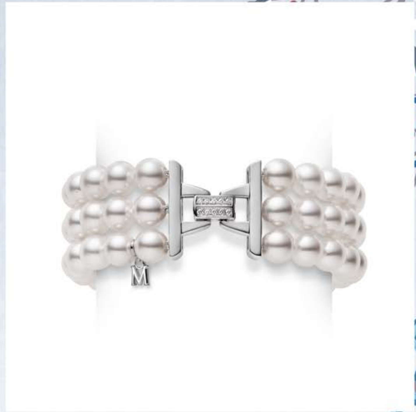
Bracelet MDQ10061ADXW US $11,000