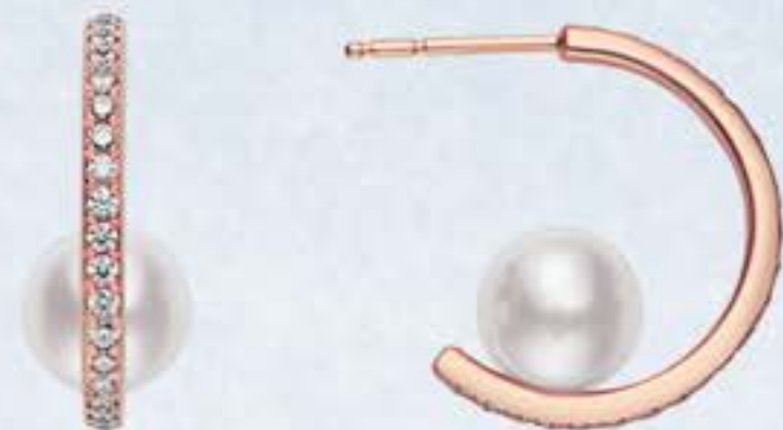
Earrings Left MEQ10098ADXW US $5,000 Earrings Right MEQ10098ADXZ US $5,000