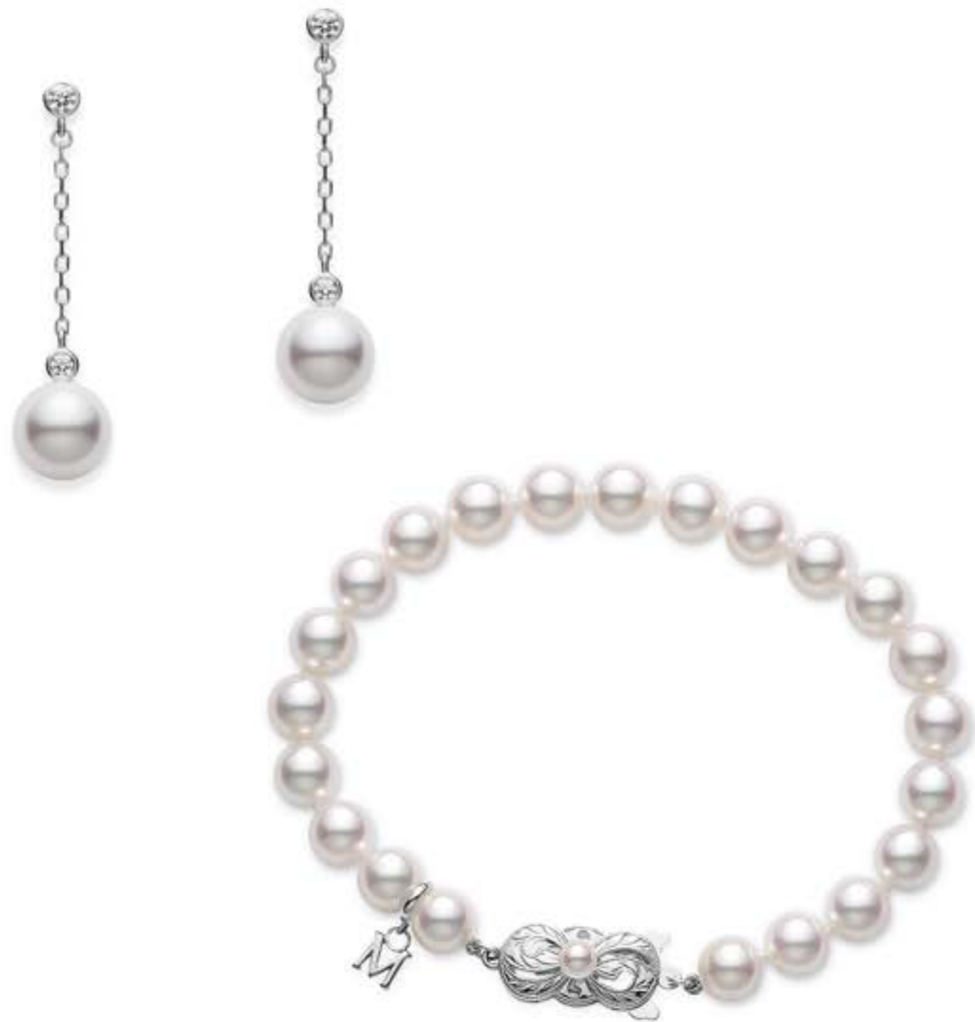
Bracelet Bottom UD70207W US $1,880 Earrings MEQ10087ADXW US $4,100