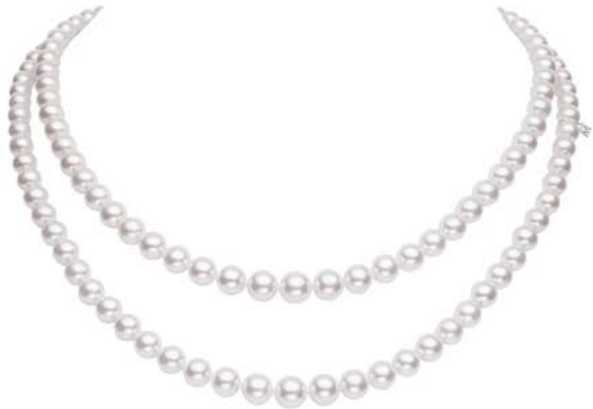
Necklace G85820D1WSPEC US $6,950