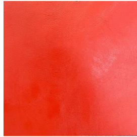
Lamb Berry Red