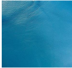
Lamb Aqua Blue