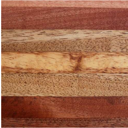
CRAHS - Clear