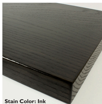
Stain Color: Ink