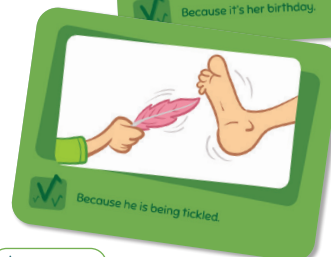
Answers on the back