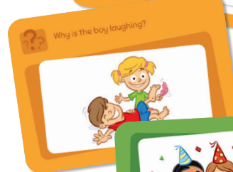
Questions on the front