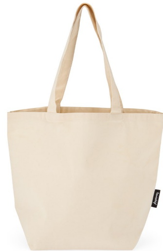
Shopping Bag | NR03