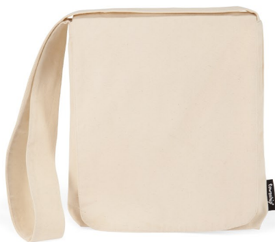
Vertical Messenger Bag | NR08