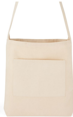
Shoulder Bag | NR07