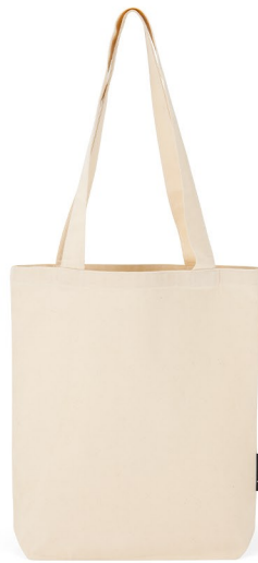
Business Bag | NR02