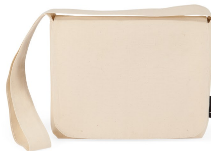
Horizontal Messenger Bag | NR09