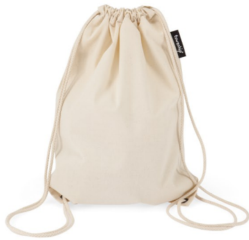
Drawstring Backpack | NR05