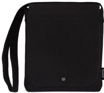
Vertical Messenger Bag | FE08