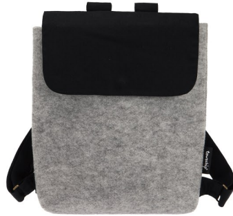
Square Backpack | FE12