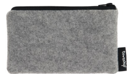
Purse | FE13