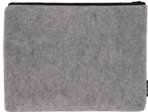
Laptop Sleeve | FE14