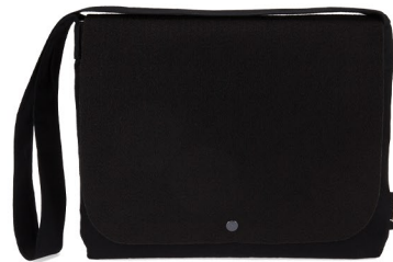
Horizontal Messenger Bag | FE09