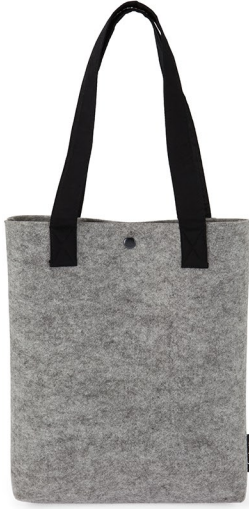
Business Bag | FE02