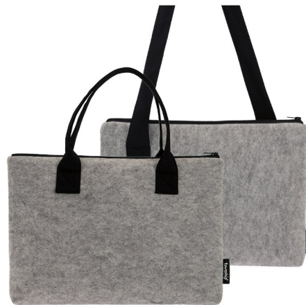
Laptop Bag | FE15