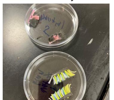
Each half was placed into a separate sterile test tube.