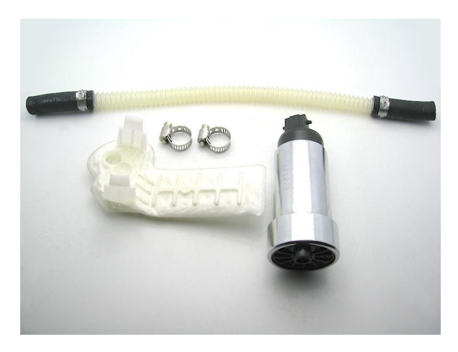
7 – install the DW65a into the center assembly by clicking the tabs on the fuel sock into place and then reinstall the center assembly into the lower assembly