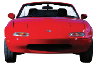
Miata M X - 5