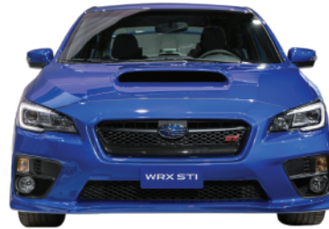
IMPREZA WRX STI