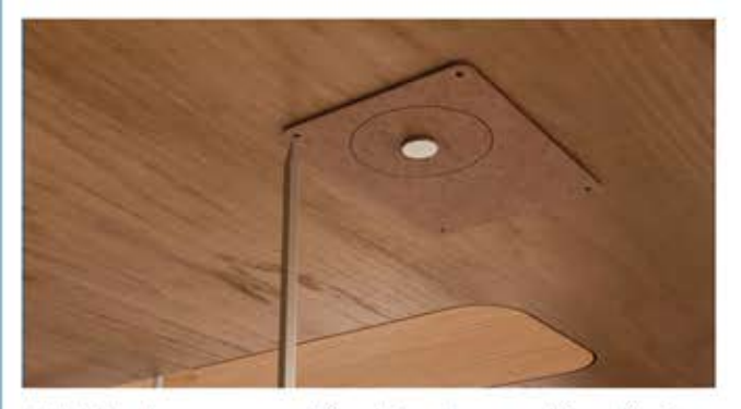
Hold the top magnet firmly in place while aligning with the cardboard magnet template under the surface to find the correct position for the ARC-H. Use a pencil to mark the screw hole locations.