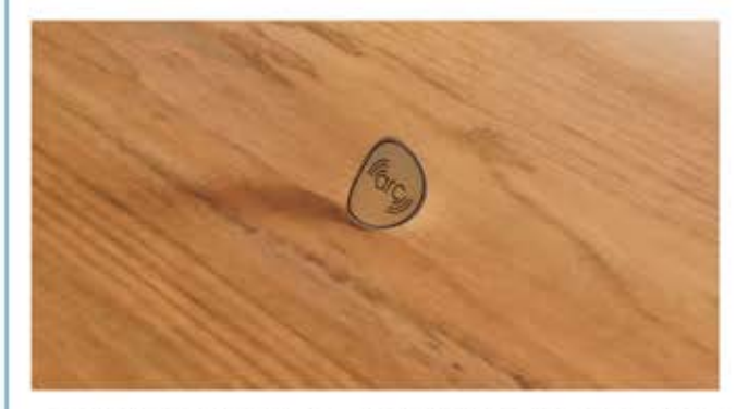
Position your wireless charging marker decal on the desk where you would charge your phone. Under desk / surface must be clear of framing, metal objects and metal structures.

INSTALLATION: ARC-H has a wireless range 15-30mm, no routing is required for thicknesses up to 25mm.