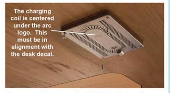
Use screws to secure the ARC-H wireless charger in place. Plug in the power supply and use cable clips to manage any loose cables. (ensure the arc logo is aligned with desktop decal marker)

Remove the backing from the wireless decal marker and stick firmly onto the clean surface. Place the magnet provided in the center of the sticker.