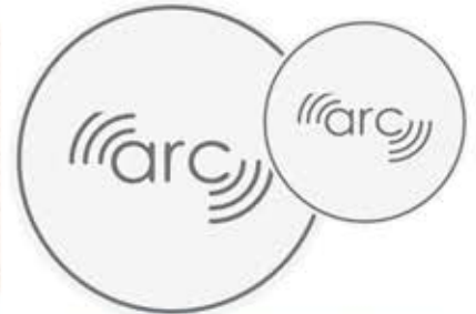
40mm & 80mm desktop decals - choose your size and colour

INSTALLATION: ARC-H has a wireless range 15-30mm, no routing is required for thicknesses up to 25mm.