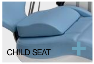
CHILD SEAT +

Protection cushion and child seat available for all DIPLOMAT chairs.