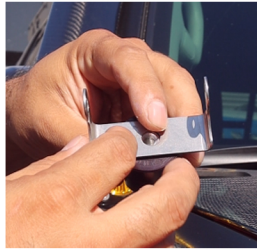
Locate light bracket.