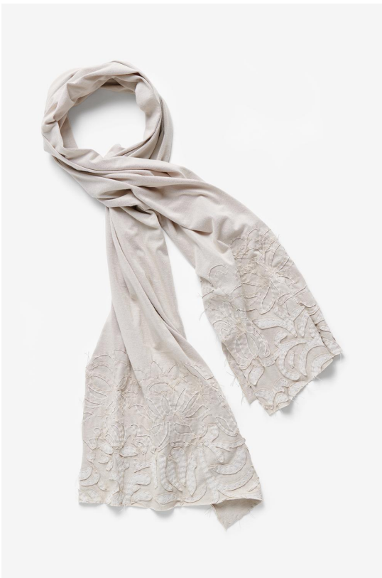
THE SCARF Shown in ANNA'S GARDEN | Sand/Sand