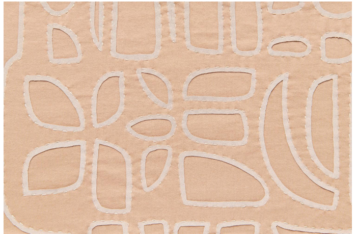
Ballet/Ballet | Shown in TONY