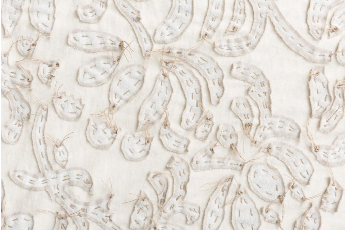
Sand/Natural | Shown in ANNA'S GARDEN