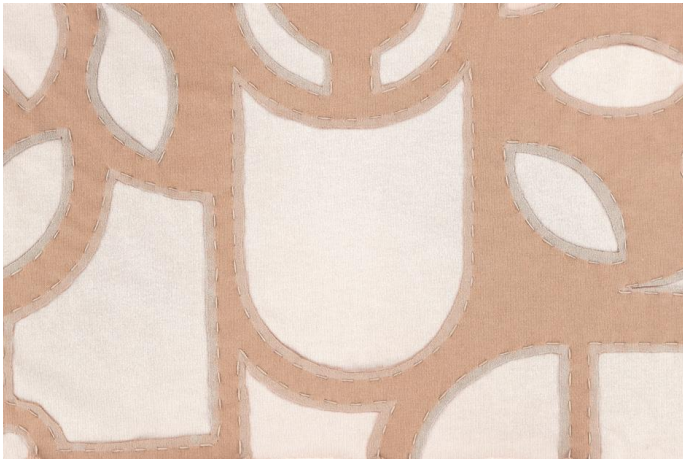
Ballet/Natural | Shown in ABSTRACT