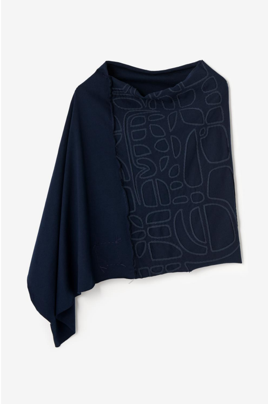
THE PONCHO Shown in TONY | Navy/Navy