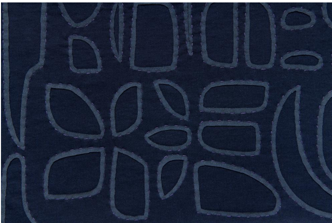
Navy/Navy | Shown in TONY