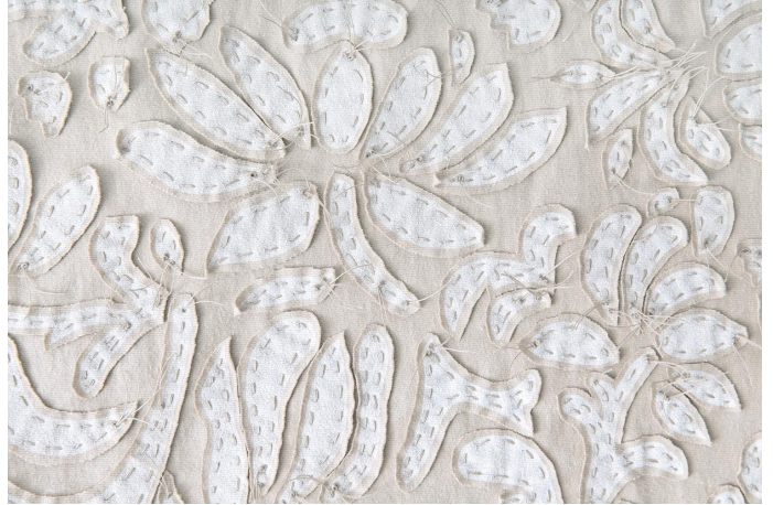
Sand/Sand | Shown in ANNA'S GARDEN