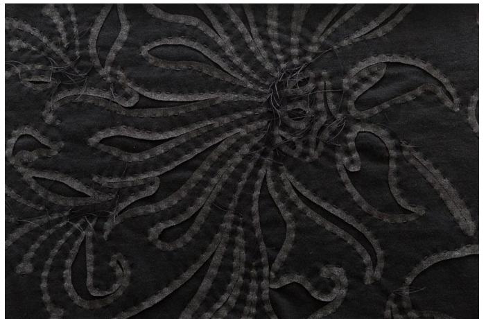
Black/Black | Shown in MAGDALENA