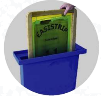
3. DIP SCREENS

(1-3 MINS OR UNTIL FILM LOOSENS FROM MESH)