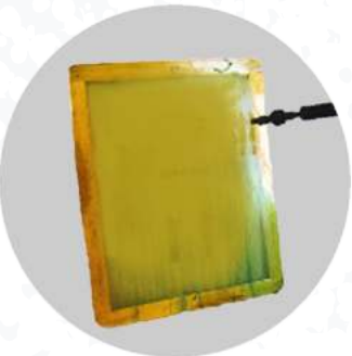
7. PRESSURE RINSE