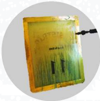
4. PRESSURE RINSE

(1-3 MINS OR UNTIL FILM LOOSENS FROM MESH)