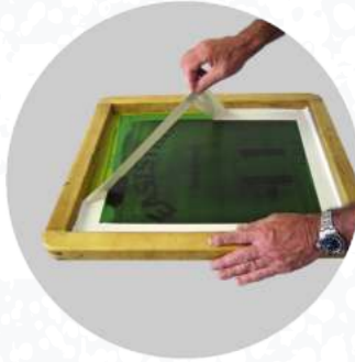
2. PULL TAPE