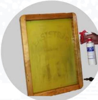
5. SPRAY EASIWAY STAIN REMOVER