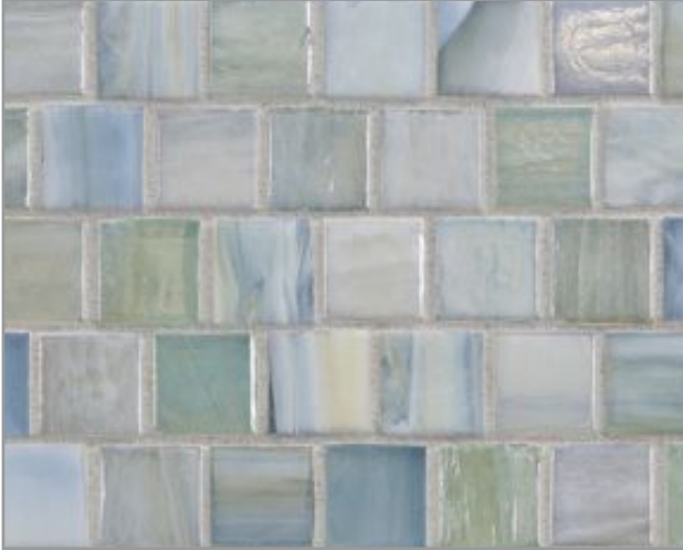
1 x 1 Offset (25 mm x 25 mm)