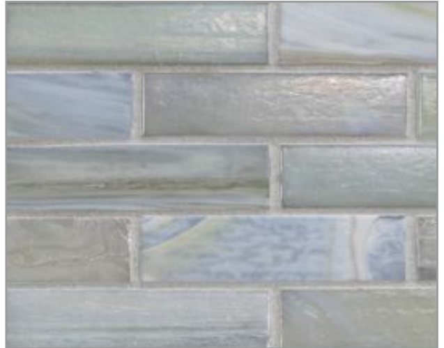
1 x 4 Brick (25 mm x 100 mm)