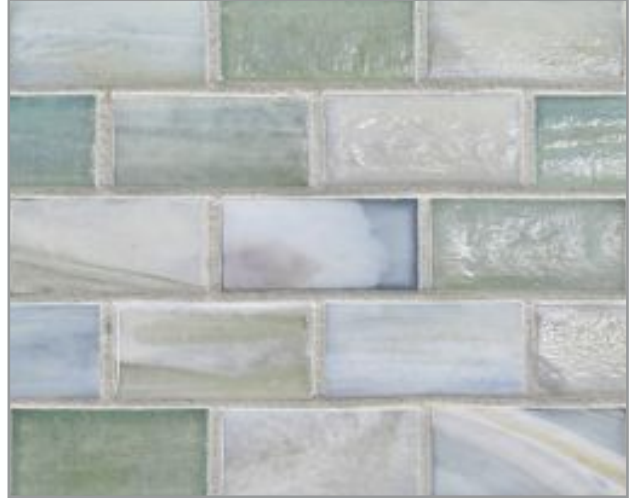
1 x 2 Brick (25 mm x 52 mm)