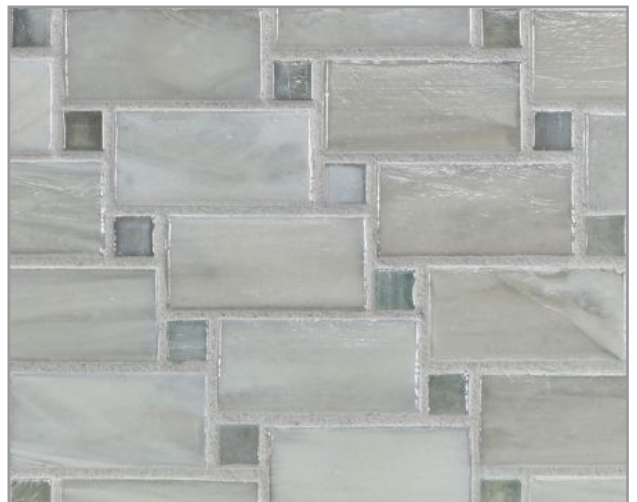
Vineyard (1/2 x 1/2, 1 x 2) (12 mm x 12 mm, 25 mm x 52 mm)