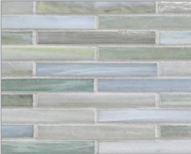
1/2 x 4 Brick (12 mm x 100 mm)