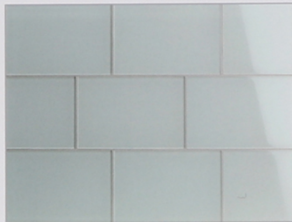
6 x 9