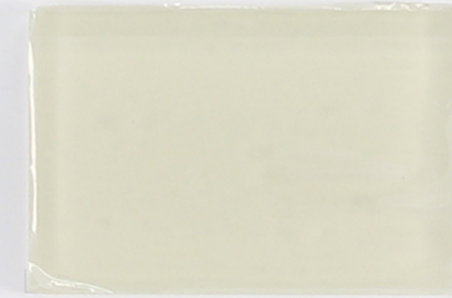
Sand Dollar Silk