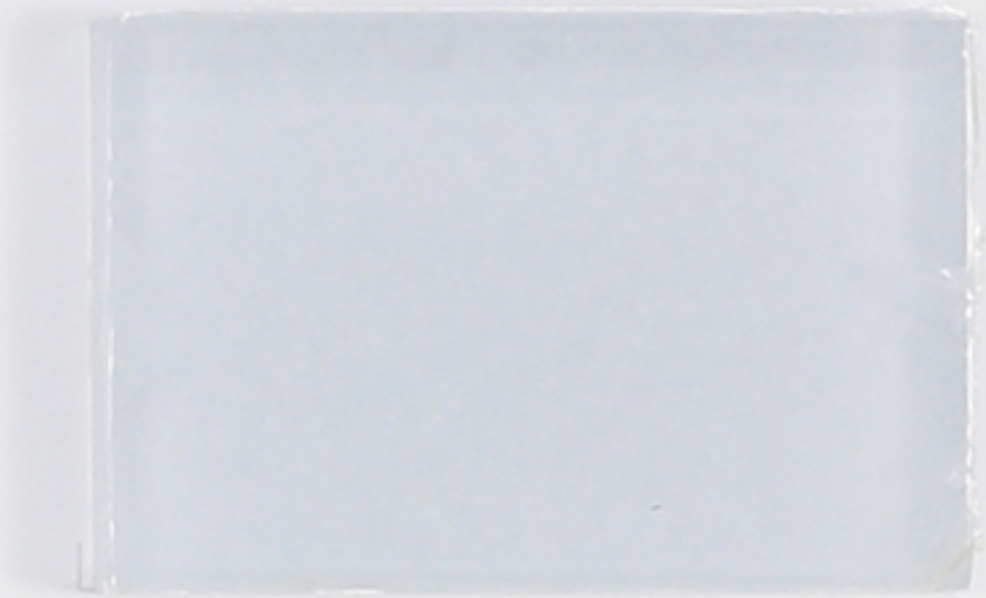
Tawny Grey Silk