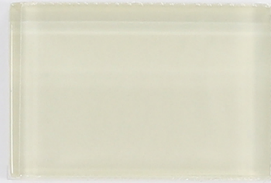
Sand Dollar Natural