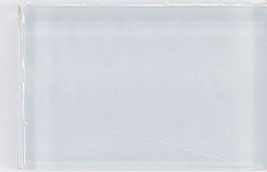
Tawny Grey Natural