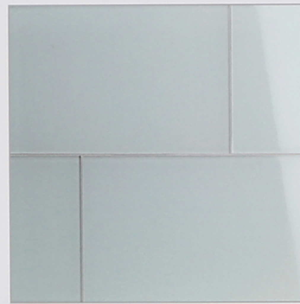
12 x 18

Material thickness: 8 mm • Color shown: Whitewater • Finish shown: Natural