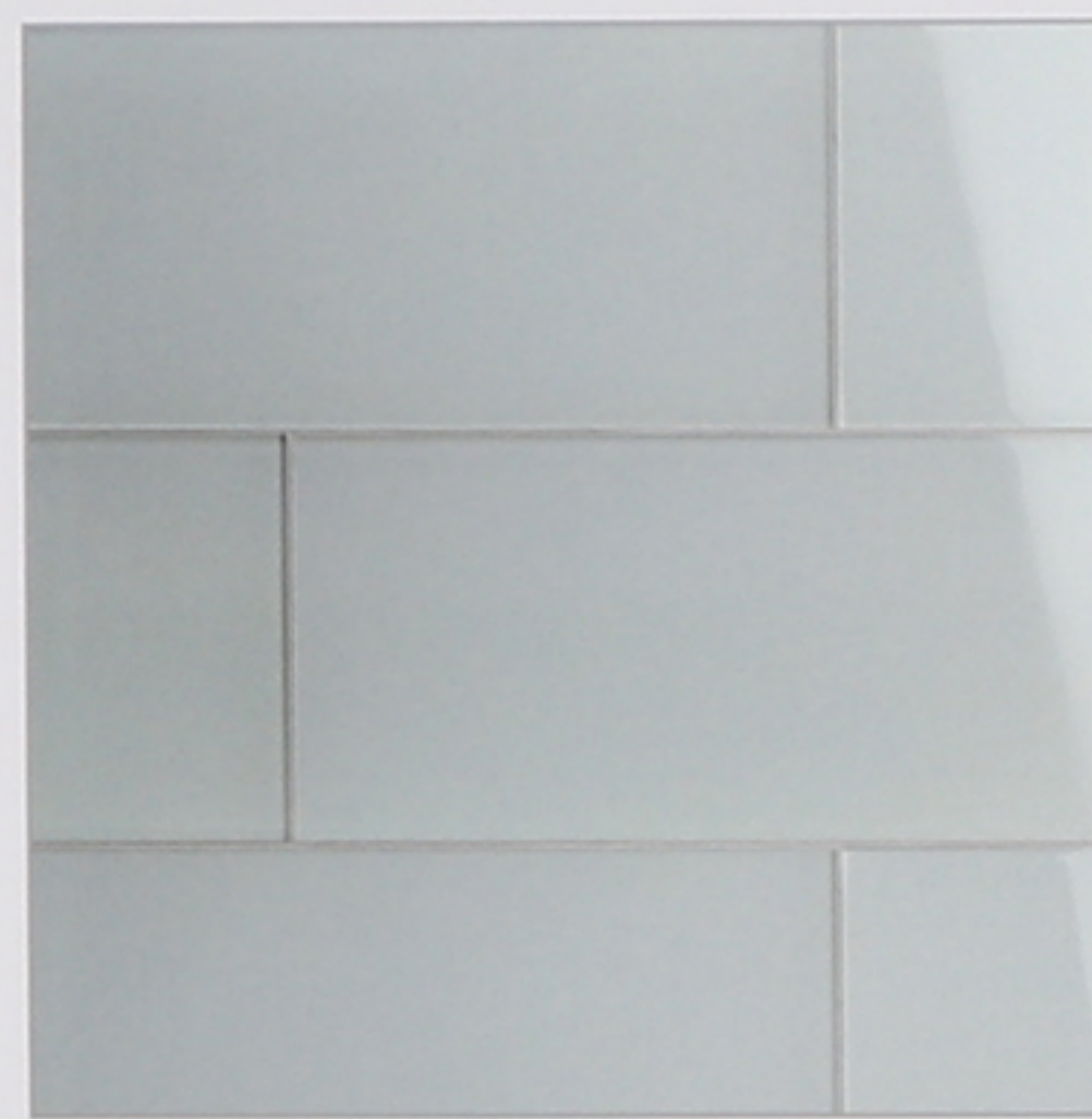
9 x 18