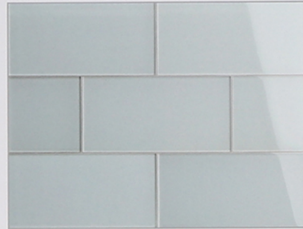
6 x 12