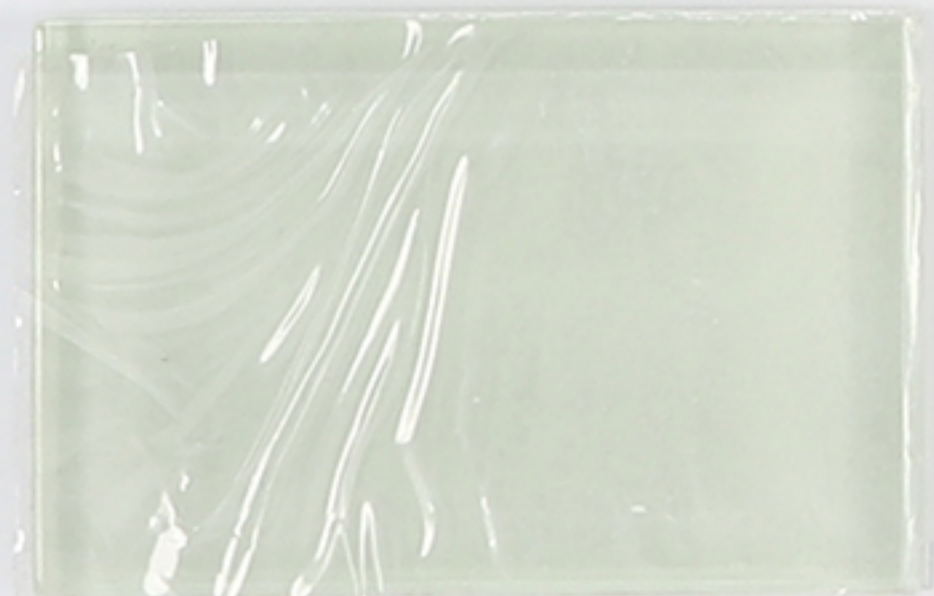
Frost Green Natural