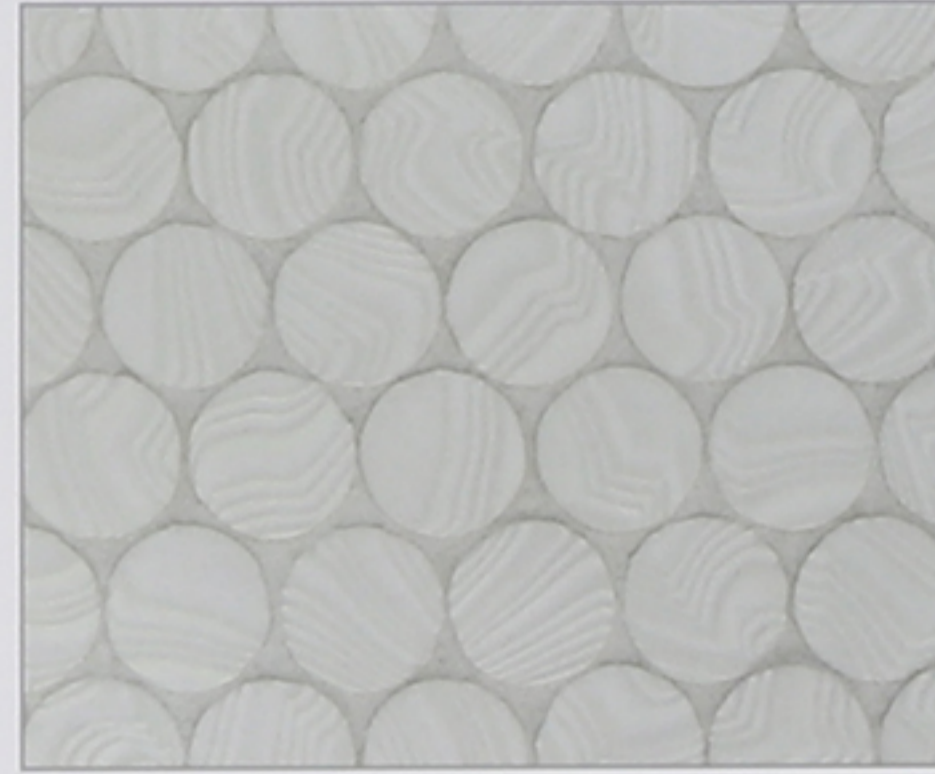
Round Ripples 1 1/2"