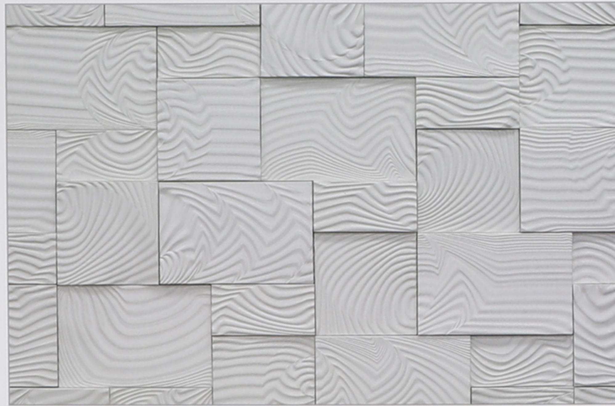
Dunes 3 pc Pattern (4 x 8, 8 x 8, 8 x 12)

Material thickness: Dimensional (see website for details) • Color shown: White Sand