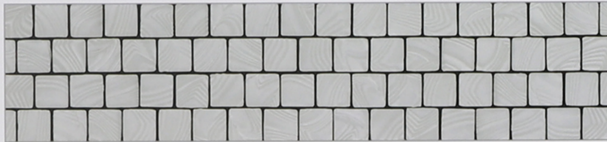
Square Ripples 1 1/4 x 1 1/4"