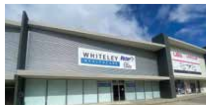
WA Store & Warehouse