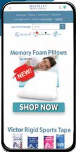
Upgraded Mobile Experience

“With our new website, we now have a second to none web experience.”