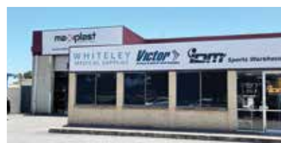
SA Store & Warehouse