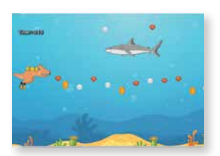
Increase Patient Motivation

Move your assessments from subjective to objective with analytical evaluations .