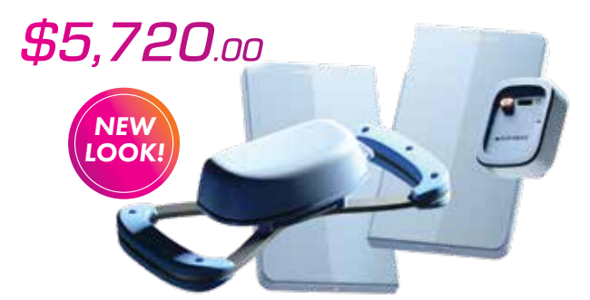
K-Push | K-Force Plates | K-Move | Twin Handle