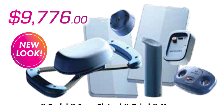
K-Push | K-Force Plates | K-Grip | K-Move K-Bubble | K-Pull | Twin Handle