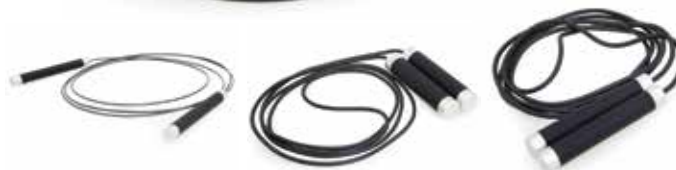
Swift Jump Rope 245gm