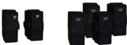
2 x 5lb Resistance Plates