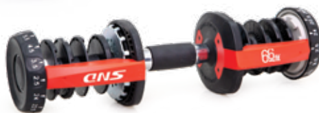
Adjustable Dumbbell set to 2.5kg

Simply adjust the dial to change the weight