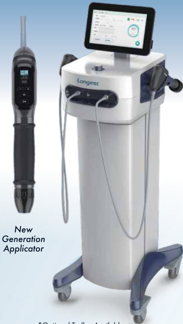
New Generation Applicator

*Optional Trolley Available SHOCKTROLLEY2500X: $1,110.00