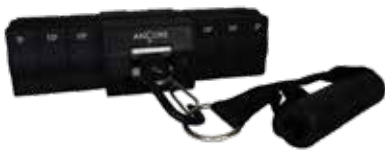
Ancore Pro Base Unit