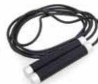
Strength Jump Rope 710gm