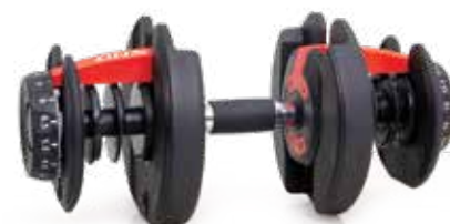
Adjustable Dumbbell set to 10kg