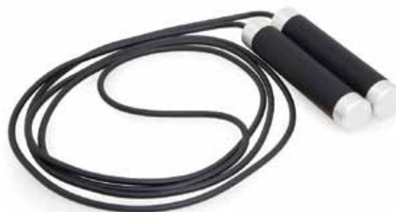
Speed Jump Rope 113gm