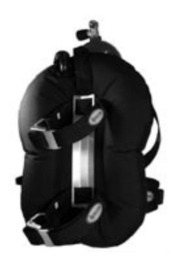
Fig. 9: Single Tank Adapter with Eclipse Wing