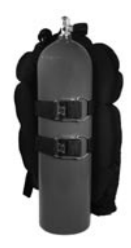
Fig. 10: Correct strap position on single cylinder