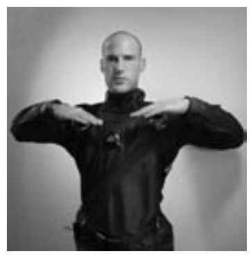
Fig. 5: Locating the proper location for the chest D-rings

To position the shoulder D-rings, extend your arms straight out to the side, parallel to the ground. Bend at the elbow and bring your thumb straight to the shoulder strap. The center of your thumb should intersect the center of the D-ring (Figure 5). Next, reach across your body to (or almost to) your left shoulder with your right arm (Figure 6). Make sure the right side D-ring