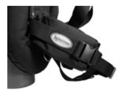
Fig 18: ACB pocket, mounted on Secure Harness waist belt

For example, a Pioneer wing might be configured with a combination of releasable and fixed ballast. Six pounds (3 kg) of fixed ballast are accounted for with the Halcyon stainless steel backplate. You may also adjust non-releasable weighting by choosing Halcyon's aluminum backplate or the weighted Halcyon Single Tank Adapter (6 lb/2.7 kg) (Figure 20). Between two and ten additional pounds (1-4 kg) can be positioned directly on your tank as part of Halcyon's Trim Weight Kit (Figures 21, 22). When properly configured and tested, tank trim weighting may assist in facilitating a heads-up position while at the surface. However, you should not consider their MC system as a replacement for a life jacket; it is not designed to function in this capacity. Proper placement of tank mounted Halcyon Trim Weights also promotes stable and consistent horizontal trim during the dive. The remainder of the necessary weighting can be fine-tuned through the use of Halcyon's Active Control Ballast system, configurable with up to 30 pounds