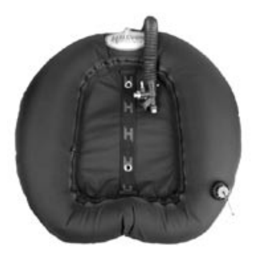
Fig. 11: Evolve double cylinder wing