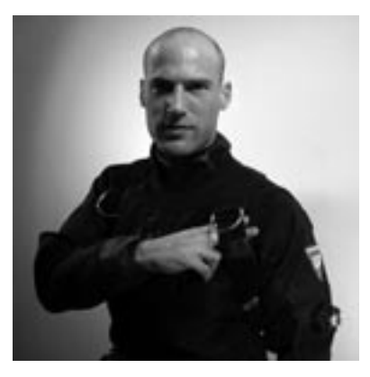
Fig. 3: Allow for at least two fingers of spacing between the harness strap and your exposure suit