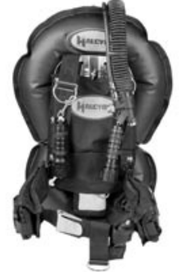
Fig. 8: Assembled Pioneer MC System with Mini-Scout Back-up Lights