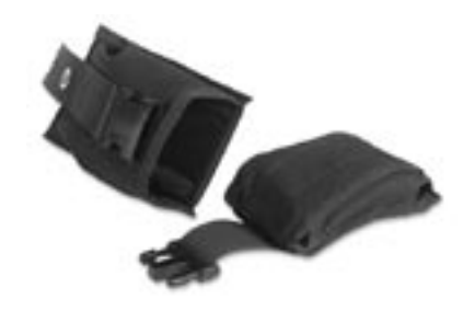
Fig 19: ACB pocket