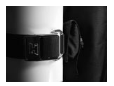
Fig 21: Halcyon Trim Weight Kit

CAUTION: You should be certain through in-water testing prior to a dive that, without any air in your buoyancy compensator, you are capable of swimming against the weight of you configuration with full tanks and all weight in place. You need verify that you are able to manage your scuba configuration in the event of a buoyancy failure.