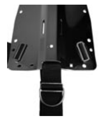
Fig. 1: Rear and crotch strap triglides

You can adjust the Halcyon MC harness without the use of special tools by adjusting the triglide fastners along the back of the backplate and on the crotch strap (Figure 1). To adjust the shoulder straps, loosen the triglide fasteners on the back of the backplate where the webbing feeds through the slots (Figure 2). Using equal amounts of webbing from both sides of the waist belt, adjust the straps so that several fingers can fit under the webbing along your shoulders (Figure 3). The shoulder straps need to be loose enough to be comfortable with your thickest amount of thermal protection. The fit of the harness should faciliate easy doff/donn, both in-water and out-