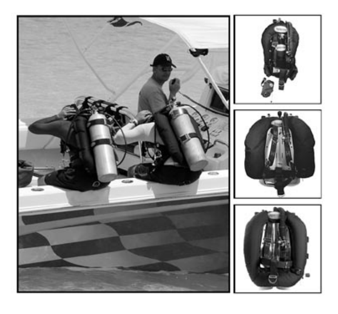
Halcyon Multifunction Compensator Owner's Manual