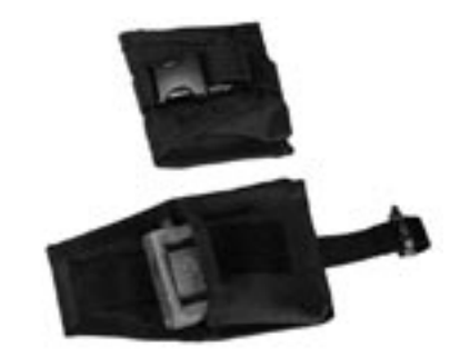
Fig 22: Use of standard lead weights with the Trim Weight Kit

Halcyon's Explorer double cylinder wings are available in 40 lb (20.4 kg) and 55 lb (25 kg) lift sizes; the Evolve wings are available in either 40 lb (20.4 kg) or 60 lb (27.2 kg) lift sizes. The Explorer and Evolve 40 wings are primarily designed for use with double aluminum 80 (10 liter) cylinders. The Explorer 55 and Evolve 60 wings are suitable for use with a wide range of aluminum and steel double cylinders, including 12/15 liter and 95/104 cubic foot steel cylinders. The Evolve 60 is suitable for twin 20 litre cylinders. Explorer and Evolve wings should not be used in any single cylinder configuration.