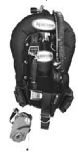
Fig. 12: Assembled Eclipse with MC Storage Pak and ACB weight pockets