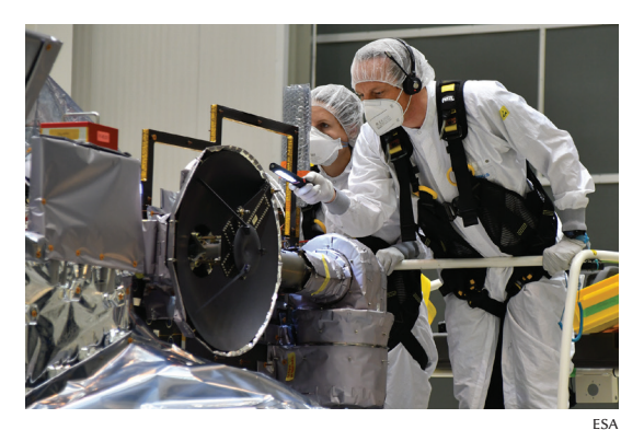
ESA's JUICE is one of several spacecraft planned to study moons of Jupiter or Saturn. These engineers are inspecting one of the spacecraff's antennas.

2020, the SpaceX Crew Dragon capsule became the first private spacecraft to take astronauts into orbit. The mission was the first crewed launch from the United States since the last shuttle mission.