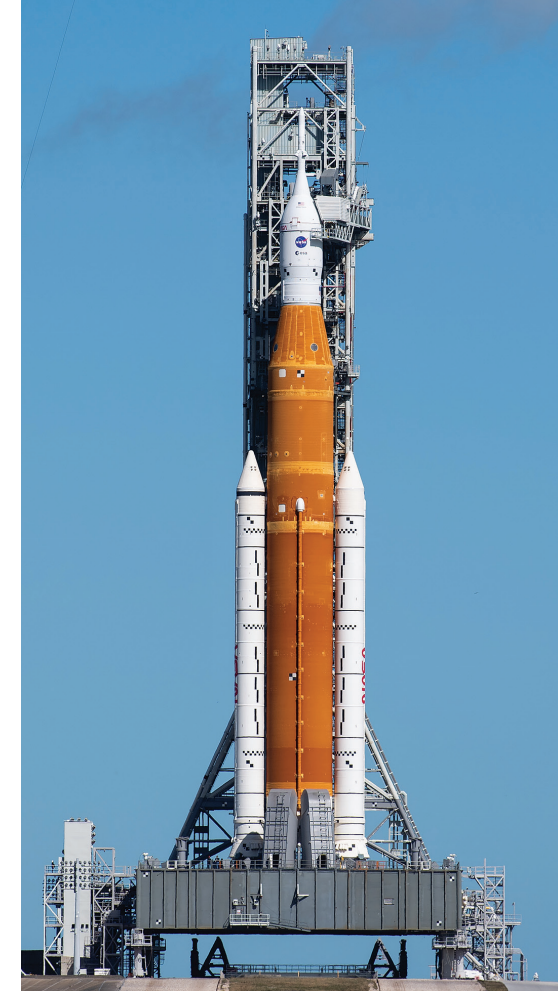
NASA's Space Launch System (SLS) is a huge rocket designed to carry astronauts to the moon. The SLS is an expendable (not reusable) rocket.

Today, NASA's Commercial Crew program contracts with private companies to take astronauts to the ISS. In