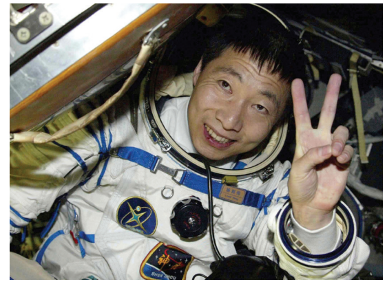
Yang Liwei was the first astronaut launched into space by the Chinese space program. He orbited Earth for 21 hours in 2003.

In 2004, U.S. President George W. Bush announced