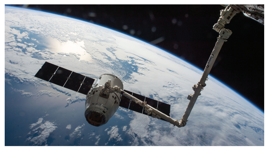
SpaceX's Dragon vehicle carries crews and supplies to and from Earth orbit. This unpiloted Dragon, carrying supplies, is held by Canadarm2,

the International Space Station's robotic arm. After this 2016 photograph was taken, astronauts used the robotic arm to dock the Dragon with the station.