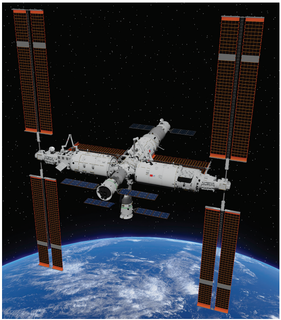
The Tiangong space station, shown in this illustration, is China's first permanent space station. It was completed in 2022. China does not work on the ISS because U.S. policy prevents NASA from collaborating with the Chinese government.

Searching for life in our solar system. Many people once thought that Earth was the only place whose current planetary conditions could support life. It was widely believed that if extraterrestrial life existed, it