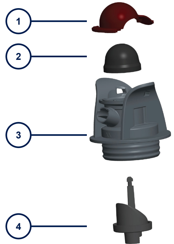
Stand-up Pouch Assembly (800661)

*Dimensions verified within 24 hrs of molding