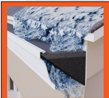
Keeps leaves out while easily letting water run through