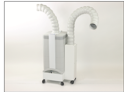
IQAir high-efficiency air purifier with FlexVac mobile source-capture kit.

In January and February 2020 IQAir arranged a number of emergency air freight shipments to Hong Kong including IQAir high-efficiency air purifiers with special FlexVac source-capture kit and OutFlow FlexAir exhaust attachments (photo). Several hundred of these specialised units with suction and exhaust ducts have been in use in over 150 Hong Kong hospitals and clinics ever since the SARS coronavirus outbreak in 2003. Hospitalised patients with COVID-19 symptoms are instructed to cough and sneeze into the flexible suction duct opening which is positioned next to the patient's head. The air containing the infectious droplet nuclei is then sucked into the system and filtered with high efficiency. Virtually microorganism-free air is expelled through the exhaust duct. The flexible duct at the top of the air purifier can be directed away from the patient, to avoid air turbulences near the patient.