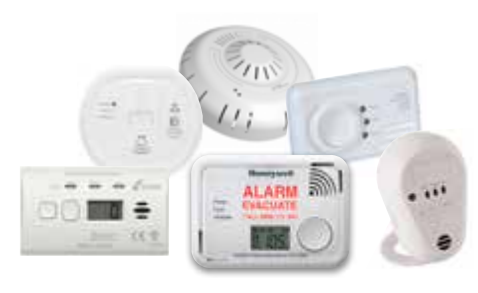
Position & operation of a CO alarm is one of the visual checks on the new HUSP form.

The HETAS warning label process is currently available to identify scenarios that pose an immediate risk, however there are certain circumstances whereby the installation does not follow the current Building Regulation guidelines or will pose a significant risk under continued use of the appliance that requires a further assessment and decision on what protocol to follow.