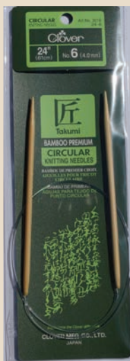
Art. No. 3016/24-6 Takumi Circular Knitting Needle 24" Size 6

*Choose crochet hook size appropriate to the size beads