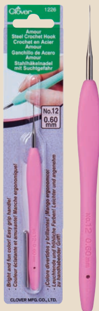
Art. No. 1226 Amour Steel Crochet Hook No. 12 0.60mm