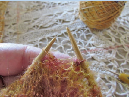
STEP 1 k2tog, sl st back on to right hand needle