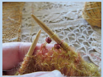
STEP 4 Once bead is positioned onto stitch, return to right hand needle.