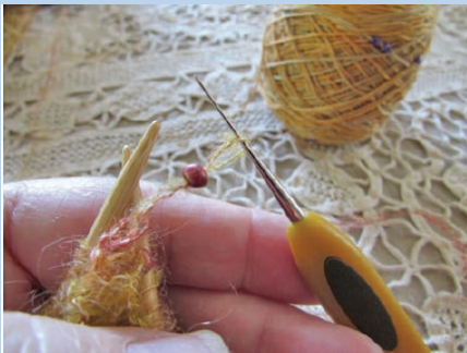
STEP 3 Bead is now on stitch