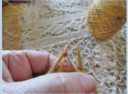
STEP 2 Using the crochet hook pick up stitch, slide bead onto stitch