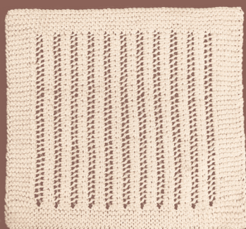
Lace Pattern 2