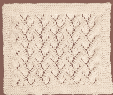
Lace Pattern 1