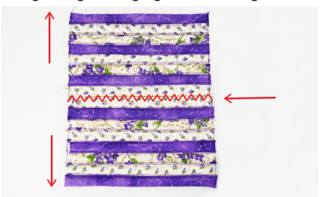
Step 7: Lay the fabric mat right side up on the zipper. Sew along the top of your fabric mat. Repeat for the other side.

Step 8: Proceed by unzipping the zipper so that when you sew the sides of your pouch you can turn it rightside out. With worng side out, sew the sides together.