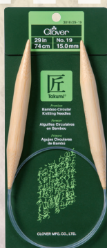
Jumbo Circular Knitting Needle (29") No. 19 Art. No 3016/29-19